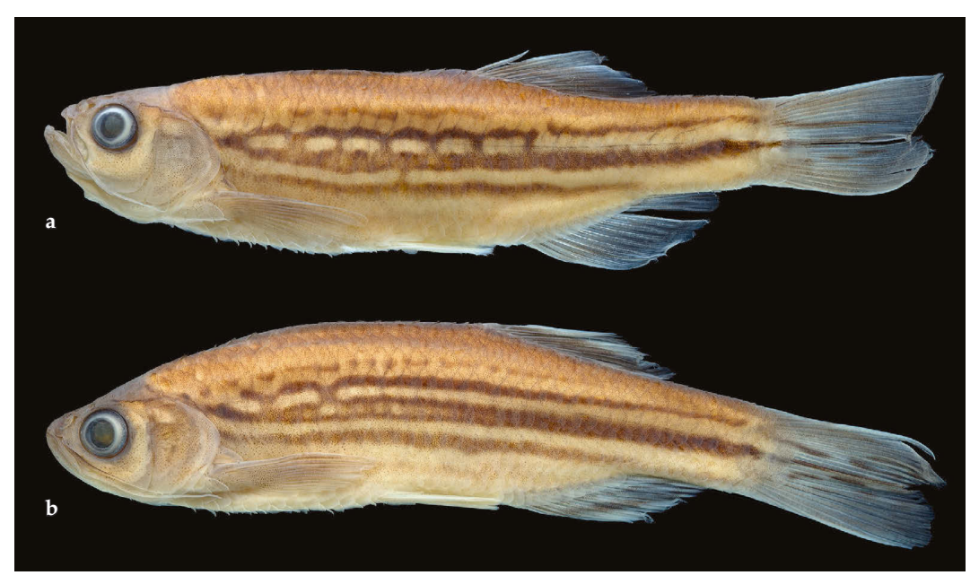
Fig. 4. Danio meghalayensis, UMMZ 243666; India: Khasi Hills: Umshing River; a, 50.5 mm SL; b, 46.5 mm SL.

barbel not reaching beyond pectoral-fin base (vs. much longer), absence or multiple rows of round or slightly elongate rings on side (vs. presence), branched anal-fin rays 10\frac{1}{2}-12\frac{1}{2} (vs. 13\frac{1}{2}-16\frac{1}{2} ); from all except D. feegradei by branched anal-fin count branched dorsal-fin rays 8\frac{1}{2} (vs. 9\frac{1}{2}-10\frac{1}{2} ); different from D. feegradei in presence of horizontal stripes along side, P, P+1 and P-1 stripes distinct, occasionally P and P+1 stripes anastomizing (vs. absence).