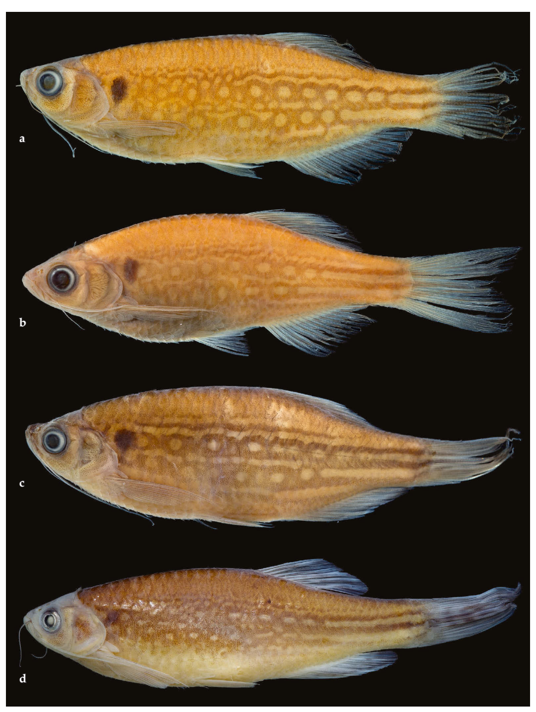
Fig. 1. a , Danio dangila , UMMZ 243658, 48.3 mm SL; India: Ganga River drainage: Ambari; b , Danio dangila , CAS 50240, 43.2 mm SL; Nepal: Ganga River drainage: Rapti River; c , Danio assamila , NRM 65571, holotype, 55.0 mm SL; India: Assam: Brahmaputra River drainage: Amguri; d , Danio assamila , NRM 51441, paratype, 57.3 mm SL; India: Assam: Brahmaputra River drainage: Nagaon, Lanka forest.