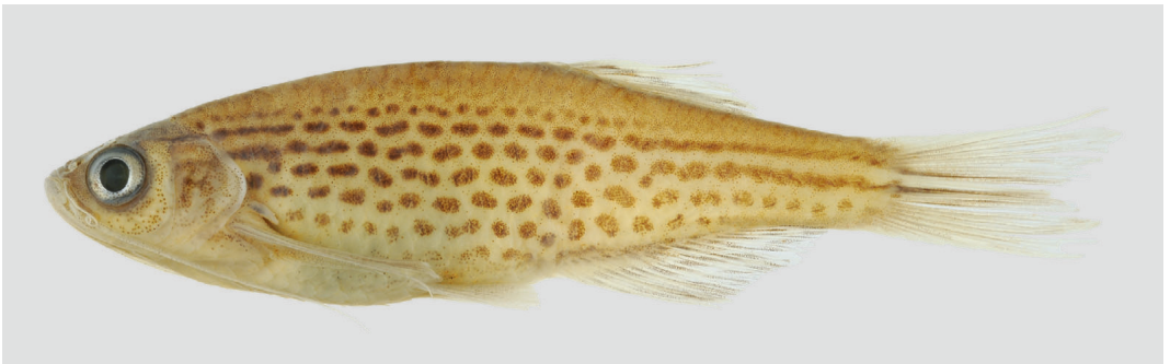
Fig. 5. Danio kyathit , paratype 37244, 31.0 mm SL. Myanmar: Kachin State: Ayeyarwaddy River drainage: Hpa Lap stream near Myitkyina.

better with D. kyathit than with D. rerio , except that in D. kyathit the stripes are disrupted into rows of dark spots (Fig. 5). In D. kyathit the P stripe may be further subdivided into two parallel rows of spots converging on the caudal peduncle. Otherwise, as in D. quagga , the P+1, P, P-1, and P-2 stripes (or rows of spots) originate behind the opercle, and stripe P-2 in the pectoral-fin axilla. Stripe P-1 runs ventral, but still more lateral in D. kyathit , and D. kyathit also possesses a short row of spots representing stripe P-3. Danio kyathit also shares with D. quagga an indistinct dark stripe at the base of the pectoral fin, and a dark stripe across the middle of the dorsal fin rays. In both D. quagga and D. kyathit stripes P+1 and P continue on the caudal fin, and there may also be some pigmentation on the lower lobe posterior to stripe P-1.