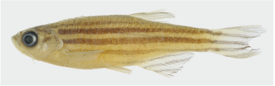
Fig. 4. Danio rerio , NRM 52658, 22.6 mm SL. India, Assam: Brahmaputra River drainage: near Kaupati.