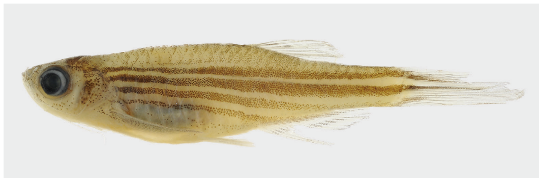
Fig. 1. Danio quagga , NRM 58705, holotype, 22.2 mm SL; Myanmar: Sagaing Division: Chindwin River drainage: small stream in Saw Bwa Ye Shan village.

row, counting scale pockets and few remaining scales. Median predorsal scales 15 (2), 16 (3). Body lateral scale rows 5 (5) above lateral line row, 1 (5) below. Circumpeduncular scale rows 10 (5). A row of scales along anal-fin base.