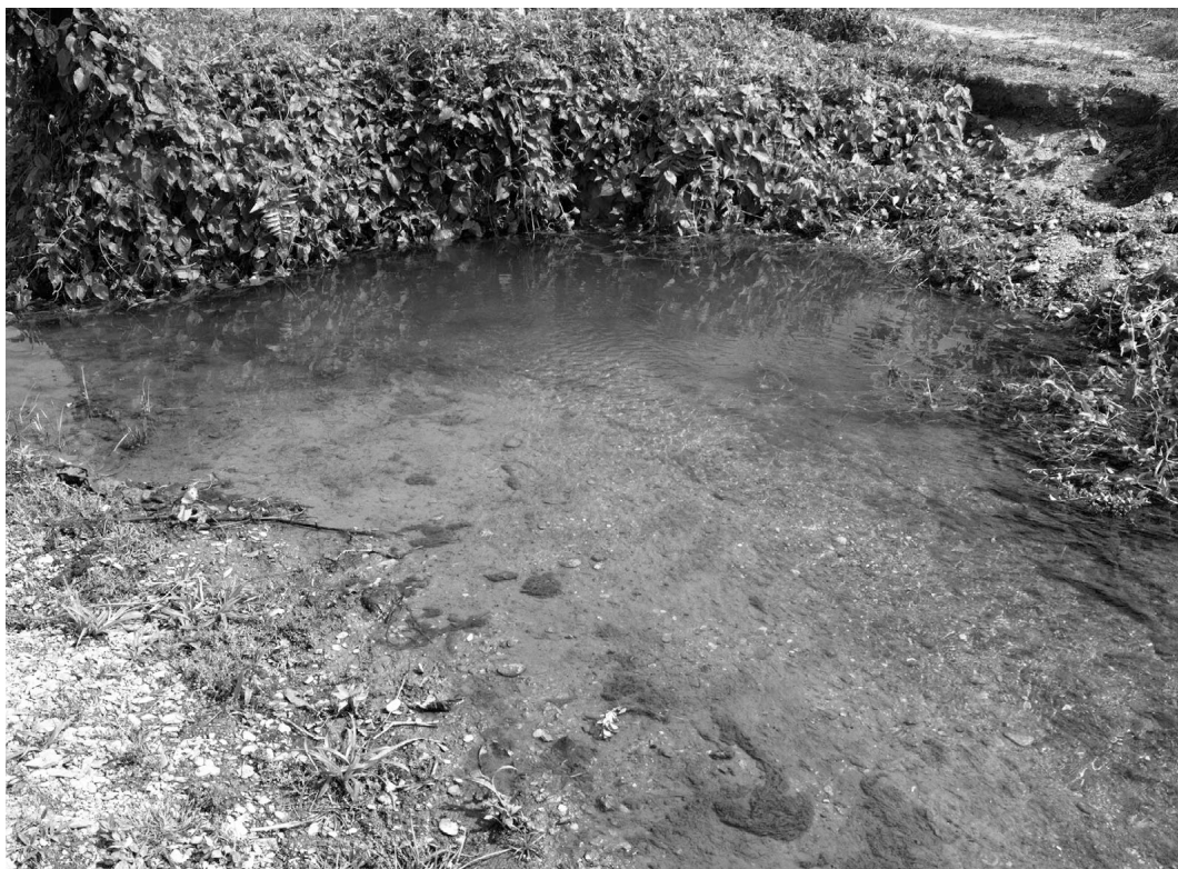
Fig. 3. Type locality of Danio quagga : small pool-like widening in small stream in Saw Bwa Ye Shan village, 28 Mar 2008.