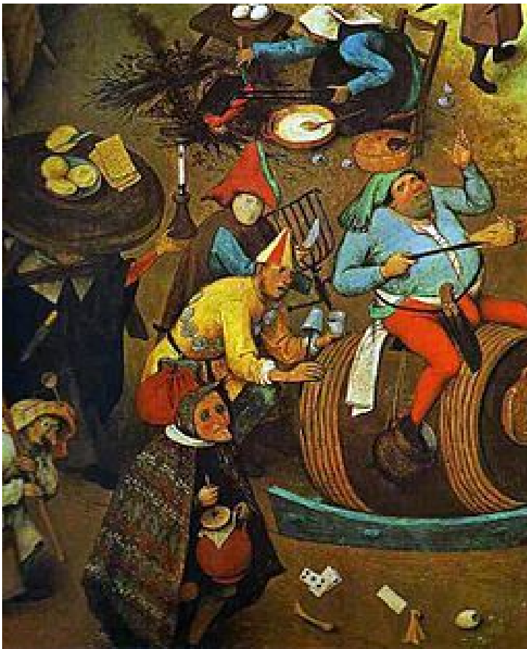
Detail of Pieter Bruegel the Elder's "The Fight Between Carnival and Lent," 1569, Kunsthistorisches Museum, Vienna. An artistic rendering of a fight between the fat and the lean.

Furthermore, there was absolutely no attempt at standardization. Some of those in the sample reported their own height and weight, often notoriously inaccurate. Those who were actually measured wore their own clothing and shoes that could distort both measurements. In the early 1940s, one of the companies, the Metropolitan Life Insurance Company, had developed tables of “desirable weight” that did not include a person’s age and introduced an initially arbitrary and subjective measure of body “frame”—small, medium and large. (Pai and Paloucek, 2000) The Metropolitan Life Insurance Company revised its tables over the years, and some may remember these were very popular benchmarks, particularly in the late 1950s and 1960s, that were used by physicians to assess “ideal weight” in their patients. During these years, Quetelet’s Index was apparently lost to history.