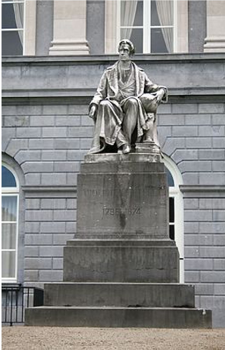
Belgian 'Renaissance man' Adolphe Quetelet, Brussels (1796-1874), one of the founders of statistics as a scientific discipline .