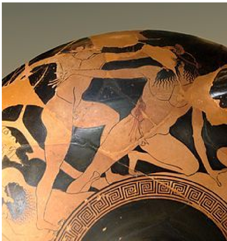
Detail from an Ancient Greek red figure amphora of Theseus killing Procrustes, Louvre Museum.