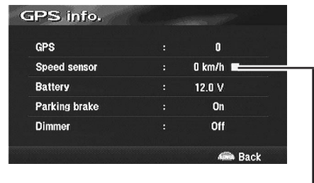
Blinks when the Speed Pulse signal is being input.

2 The GPS information screen is displayed. Confirm the setting of each item.