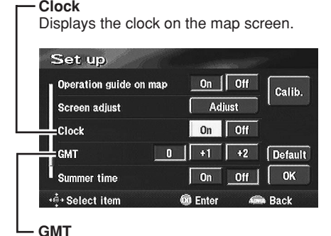
Corrects the current time if there is any time difference from GMT.

When the settings have been completed, select "OK" by tilting the joystick and press ENTER.