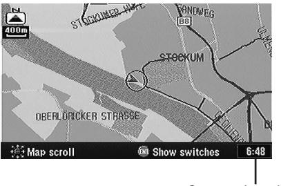
Current time display

When the settings have been completed, select "OK" by tilting the joystick and press ENTER.