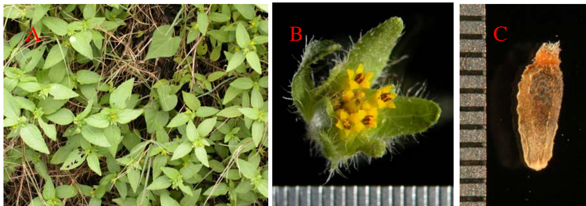
Fig. 2. A: Eleutheranthera ruderalis growing along the roadside. B: The morphology of an inflorescence with 9-11 disc florets. C: Achene verrucose on the 4-angles. (Scale = 0.5 mm).

Habitat: Eleutheranthera ruderalis is fairly common along roadsides, on waste lands, and on cultivated ground, often associated with Ageratum houstonianum Mill., Bidens pilosa L. var. radiata Sch. Bip. (Asteraceae), Cardamine flexuosa With. (Cruciferae), Cleome rutidosperma DC. (Capparaceae), Panicum maximum Jacq. (Poaceae), and Pouzolzia zeylanica (L.) Benn. (Urticaceae). Flowering and fruiting are possible throughout the year.