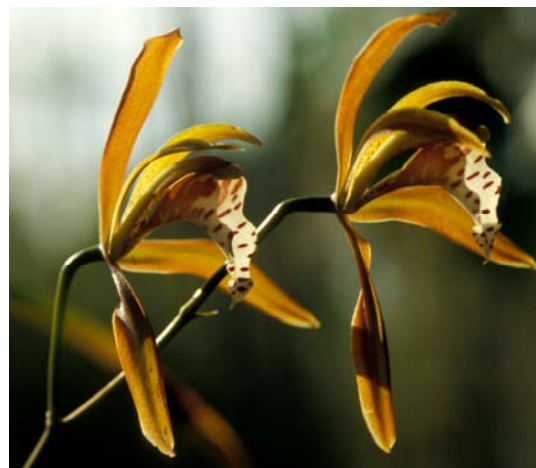
Fig. 3. Cymbidium tigrinum , originally collected from Phu Soi Dao, flowering at Romklao Plant Collection Centre, March 2005. A spirit sample ( Suddee et al. 2160 ) was subsequently prepared from the same plant.

Notes: Until now C. tigrinum has been known from Myanmar, Nagaland and western Yunnan (Du Puy and Cribb, 2007). Additionally, Seidenfaden (1983) recognized it as member of the Thai orchid flora, based on an old record by Berkeley from "the Siamese frontier" (Hooker, 1890–1894: 10). However, it remains unknown if Berkeley made his find in Thailand or Myanmar, for which reason the new collection from Phu Soi Dao in Phitsanulok represents the first confirmed record of this species from Thailand. The Thai plants were collected in hill evergreen forest by staff from Romklao Plant Collection Centre in 2004. A spirit collection was prepared from individuals that the first author found