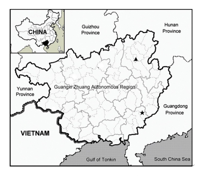
Fig 3. Distribution of Paraboea crassifila (\bigstar) and Paraboea guilinensis (\blacktriangle) in Guangxi Zhuang Autonomous Region, China.

Additional specimens examined: (paratype) CHINA: Guangxi: Yulin City, Rongxian County, Shizhai Town. 270 m, 24 March 2015, Wei-Bin Xu 12127 and 12128 (IBK). The same locality, 3 June 2012, Shui-Song Mo & Yu-Song Huang Liuyan1016 (IBK) and Yu-Song Huang & Shui-Song Mo Y1506 (IBK).