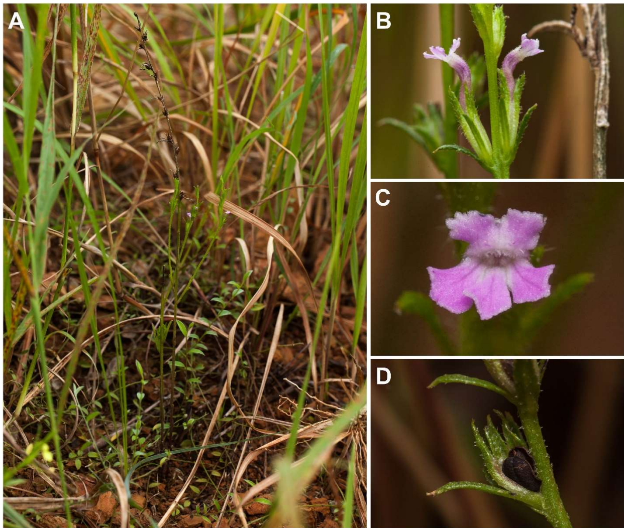
Fig. 2. Striga crispata (Z. -X. Chen s. n., PPI 78580). A: Habit. B: Flower, with 1-bract and 2-bracteolates. C: Corolla lobes rhombus to ovate in shape (face view). D: Fruit black or brown in color at maturity stage; calyx persistent and longer than the fruit.

mm, prominent reticulates with protuberances on the surface, brown, glabrous.