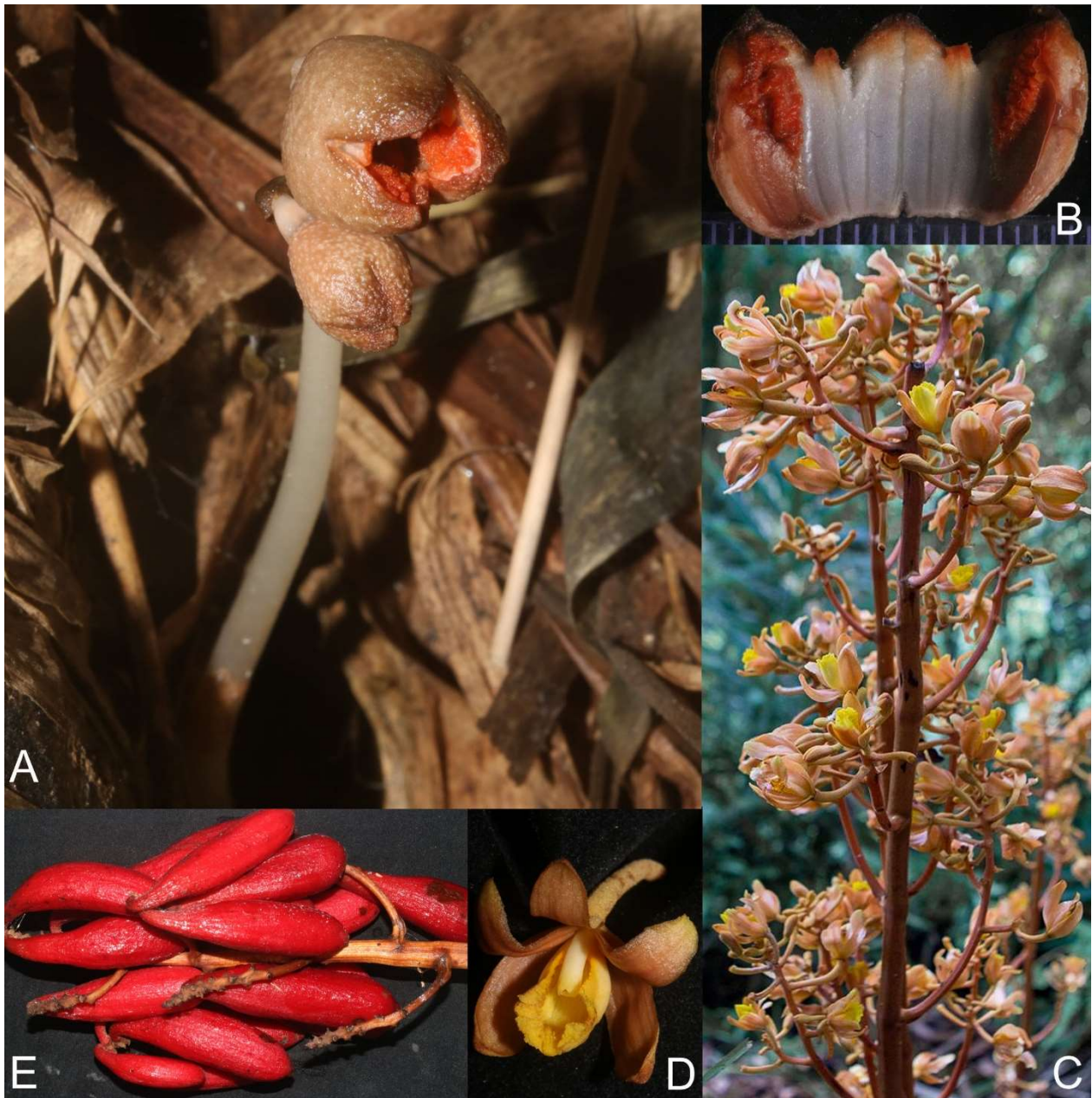
Fig. 2. Gastrodia kaohsiungensis and Cyrtosia septentrionalis in their natural habitats. A: Flowering plant of G. kaohsiungensis . B: Perianth tube of G. kaohsiungensis . C: Flowering plant of C. septentrionalis . D: Flower of C. septentrionalis. E: Fruits of C. septentrionalis .