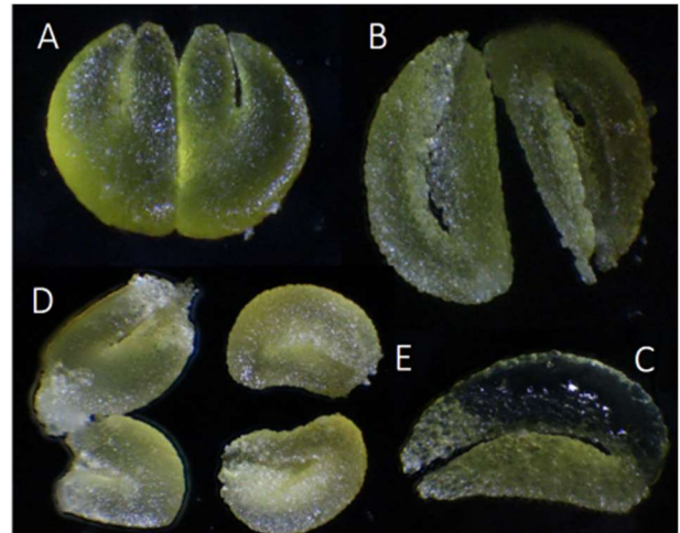
Fig. 3. Pollinia images of A. Erythrorchis altissima , B. Cyrtosia septentrionalis , C. C. javanica , D. C. lindleyana , and E. C. falconeri .