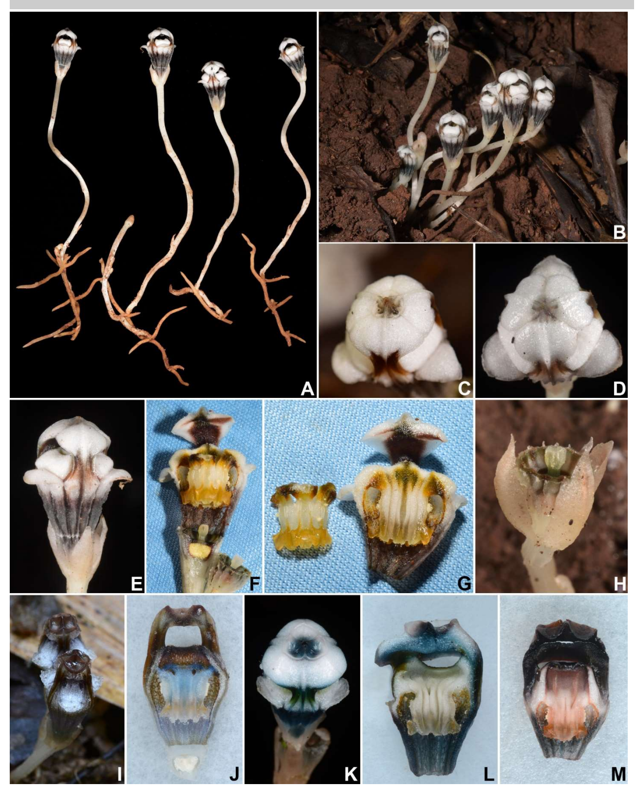
Fig. 2. Thismia submucronata (A–H): A: Plants with underground parts. B : Plants in natural habitat. C–D : Top view of mitre. E : Side view of flowers. F–G : Longitudinal section of flowers. H : Young fruit, showing ovary and stigma. T. angustimitra (I–J): I: Flowers. J: Longitudinal section of flower. T. mirabilis (K–L): K : Top view of mitre. L: Longitudinal section of flower. T. nigricans (M): M . longitudinal section of flower.