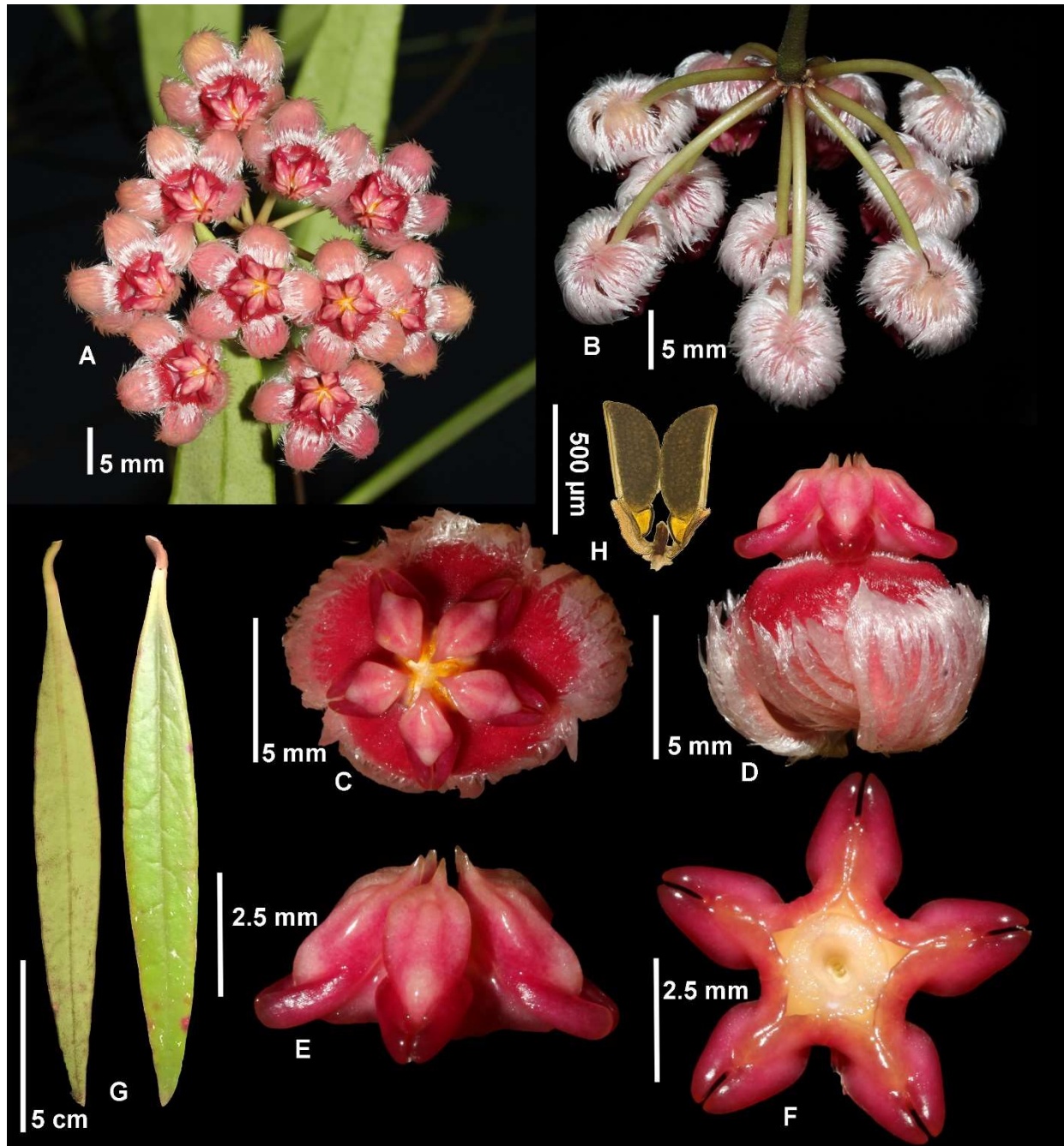
Fig. 1. Hoya sulawesiana S.Rahayu & Rodda. A , inflorescence; B , inflorescence, side view; C , flower, top view; D , flower, side view; E , corona, side view; F , corona, from underneath; G , leaves: right, from above; left, from underneath; H , pollinarium.

(1.5–)2–4(–7) × (1–)1.5–2.5 cm, with a cuneate (round) base, and an obtuse (round) apex, while the leaves of H. sulawesiana are much larger, lanceolate or elliptic, flat or slightly carinate, 7–30 × 1.5–3.5 cm, with an acute base, and an acute or acuminate apex. The corolla lobes of H. sulawesiana are covered on the outside with dense long hair recurved towards the corona inside while the hairs on the corolla lobes of H. isabelchanae are straight and point outwards.