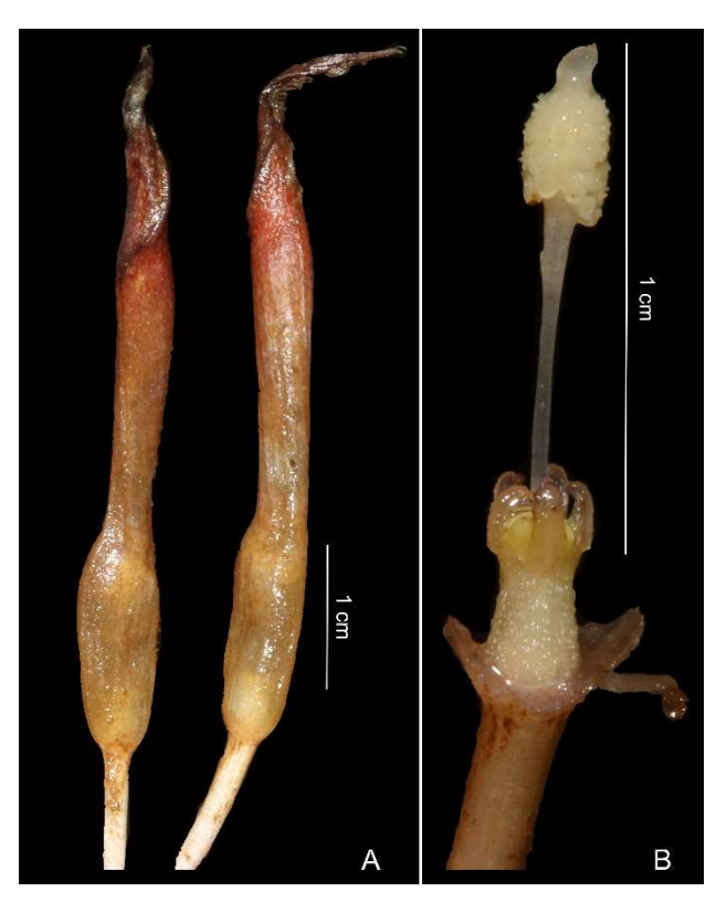
Fig. 3. Submerged flower of Cryptocoryne paglaterasiana A. Unopened spathes B. Spadix. 542

The discovery of this new species highlights the importance of citizen science and the need for their engagement in exploring and conserving our Philippine biodiversity. In addition, this discovery signifies the urgent need to extensively explore the flora of Philippine archipelago most especially in the Zamboanga Peninsula as there are still more species awaiting discovery and description ( e.g. , Mazo et al. , 2021, 2022a, b; Mazo and Rubite, 2022; Mazo, 2022) and given the increasing pace of forest destruction and habitat loss. Given the precarious state of this new species, propagation and ex situ conservation should be done to create enough stock for conservation work and for the possibility of reintroducing this species in its natural habitat.