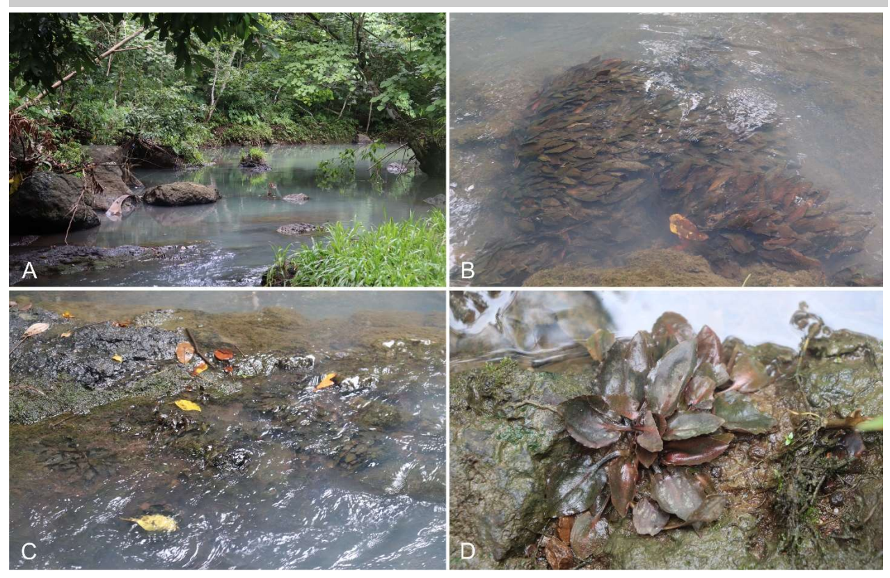
Fig. 2. Habitat pictures of Cryptocoryne paglaterasiana A. Detail of habitat B. Plants in deeper water with long leaves. C. Plants fastened in cracks in the bedrock. D. Emergent plant fastened in the rock.