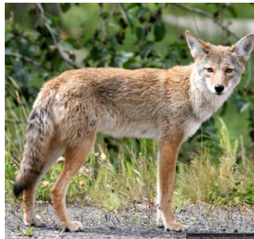
Gewe (geh-we) Coyote