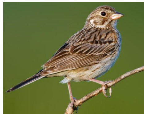
Tebe? gum si·su Sparrow