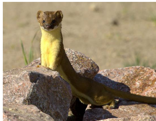
Pewećeli (peh-wets-illy) Weasle