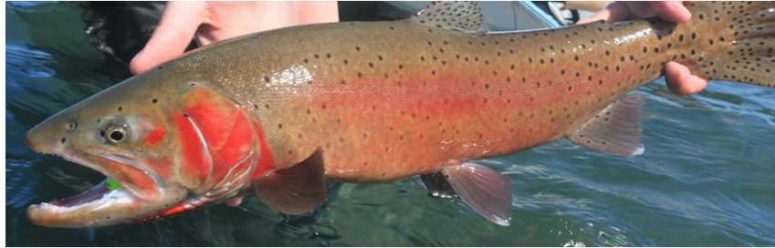
?Imgi (im-gee) Cut throat