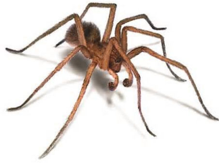
Ćiki (tsoo-koo)- Spider