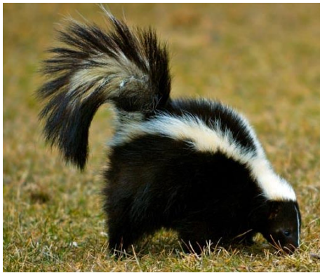
Tupipiwi? (to-pipi-eweh) Skunk