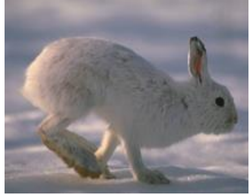
Miki? (mooh-key) snowshoe rabbit