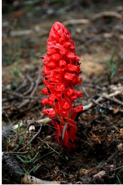
Geweʔmukuš (Geh-weh-mu-kush) Snow plant Sacodes sanguinea