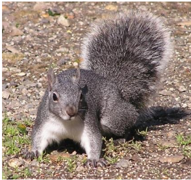
Pawawʔli Grey squirrel