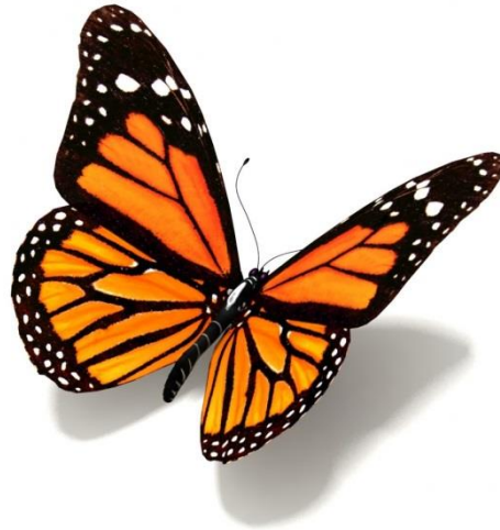
Palo·ʔlo (pah-lo-lo) Butterfly