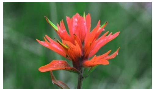
Dewdilek or Mošan Indian Paintbrush Castilliga, red