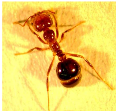
Ćo·šiniʔ (ts-oshing-eeh) fire ant