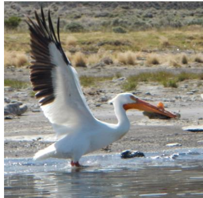
ćikikhu (tsuk-tsuk-hoo) Pelican