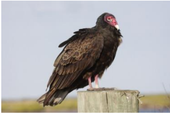
Huʔim (hoo-zhum) Buzzard