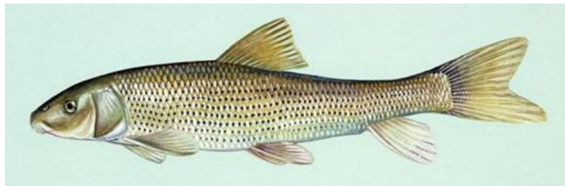
Bakwanhu Sucker fish