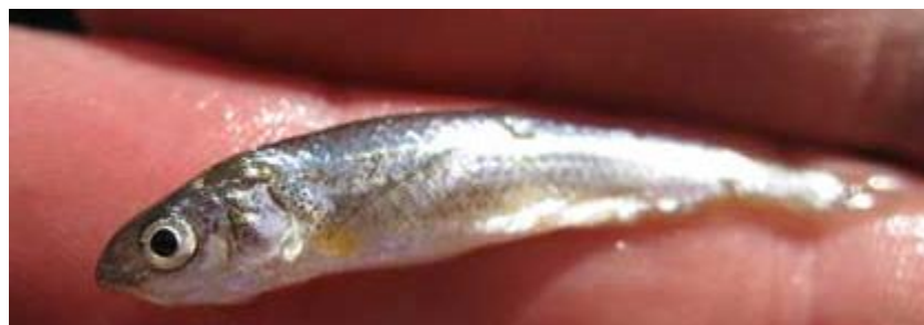
Mede·ćili? (meh-deh-tsileeh) Minnow