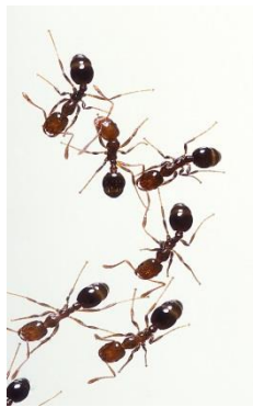
ʔA·ni (awnee) Ant