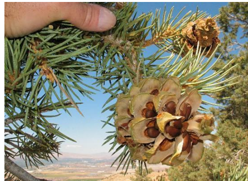
Tʼagim ya·kaʔ- cone