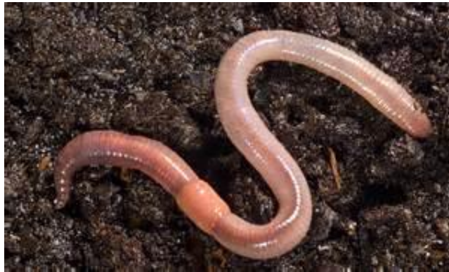
Ge·šu- (geh-shoo) Earthworm