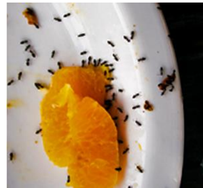
daši·naʔi (dah-shina-ee) sugar ants