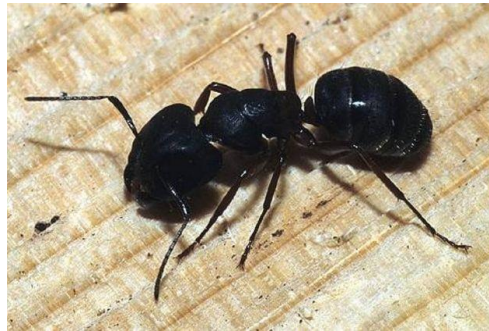
Yagil tayuŋi (yagool tye-ungee) Carpenter Ants