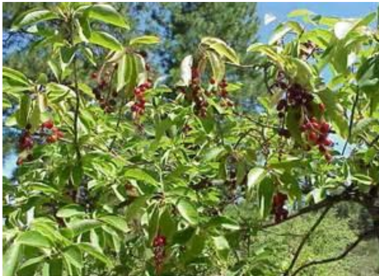
Ćamdu (tz-ahm-do) Western chokecherry Prunus virginiana var. demissa