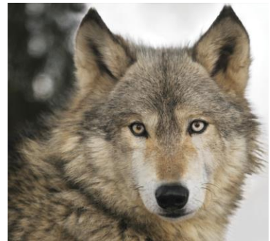
tu·li·ʒi (to-lee-zhee) Wolf