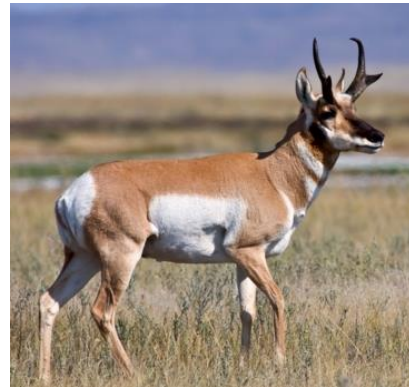
?Ayis (eye-iss) Antelope