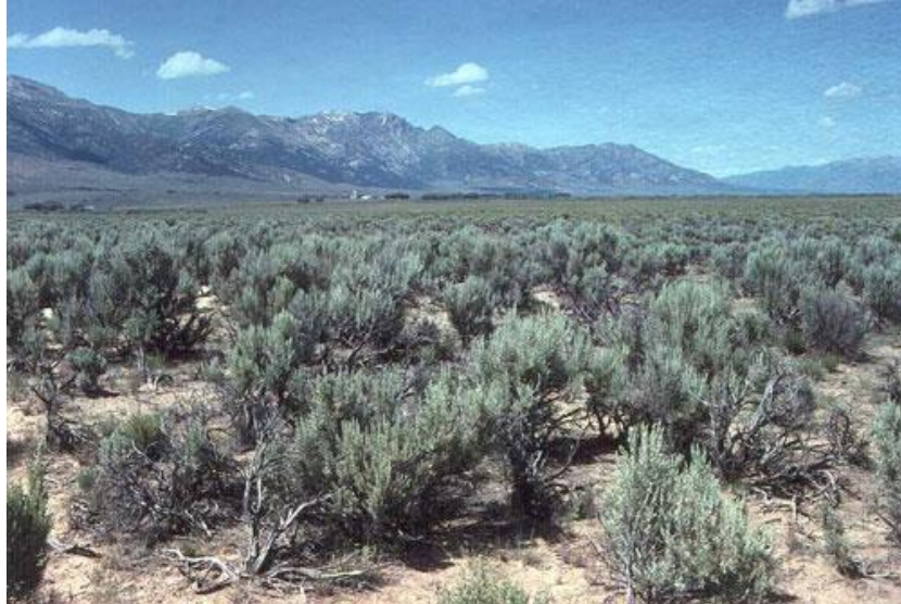
Da·bal (dah-ball) Big sage Artemisia tridentate