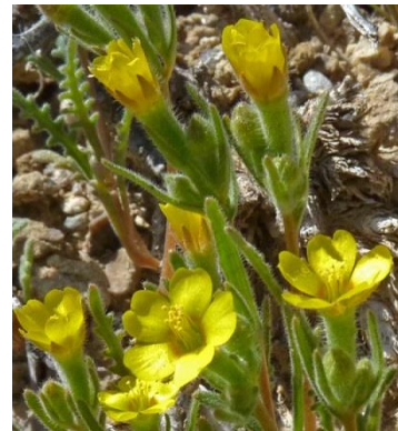
Da-hal (dah-hall) Sand Seed Mentzelia albicaulis