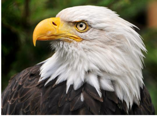
Patal̥niʔ (pah-taw-ngee) Eagle