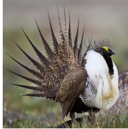
ċi·yuk (tsee-yuk) Sage Grouse