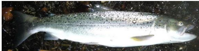
K'i·ki·di? (kee-kee-deeh) Silver fish