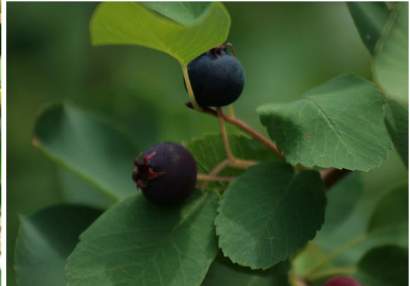
Šuwetik (shu-wet-uk) Western Service Berry Amelanchier