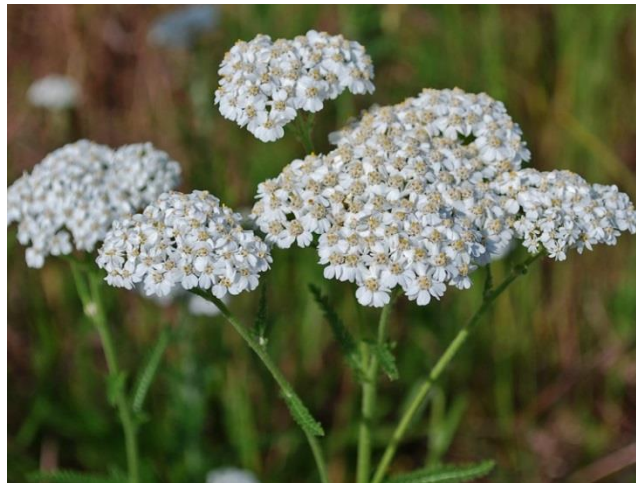
Wemšiʔ (wemsheeh) Common yarrow achillea