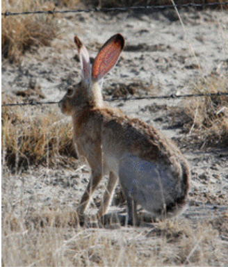
Pelew (pell-ew) Jack Rabbit