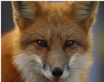
Waćiha (wats-eeha) Fox