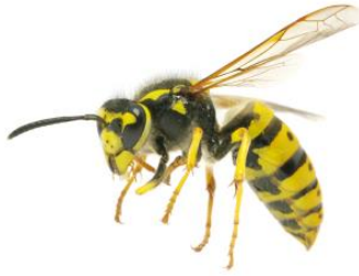
Go·ci- (go·tsee) Yellow Jacket