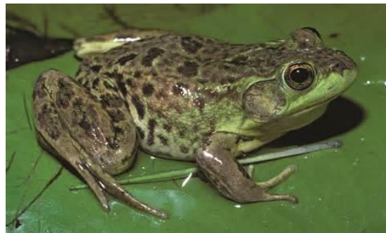
Go-ta? (go-tah) Frog