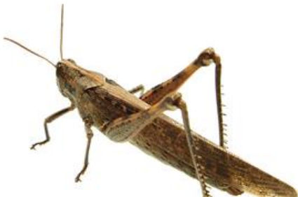
Pago·?tumhu (pah-goh-tumhoo) Grasshopper