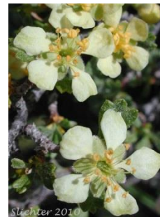
Balṅaṅcaṅ (bal-nga-tzang) Bitterbrush Purshia tridetata