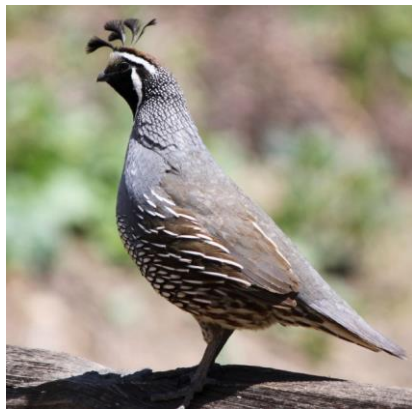
T'etil Valley quail