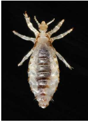
Ći·bel (tsee-bell) Louse