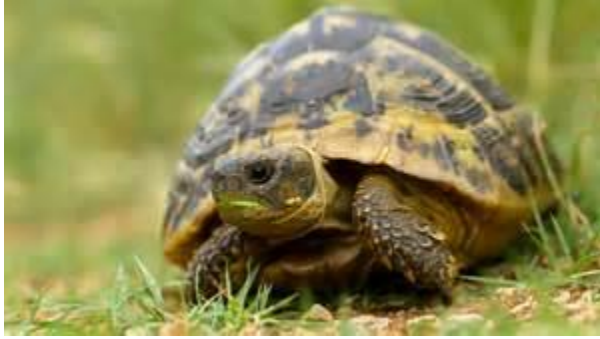
K'awandada? (Kga-wan-da-dah) Desert turtle