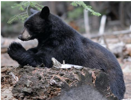
Mide? (moo-deh) Black bear