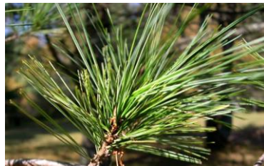
Boyoŋ (boy-ang) Pine needle