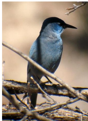
ćašu (tsah-shoo) Pinion Jay