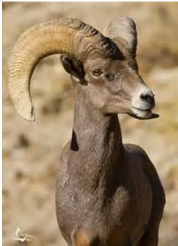
?O-gal Mt. Goat