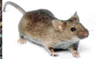
Pu·šalaʔ House mouse