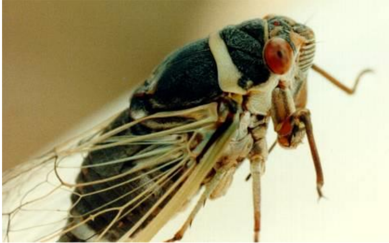
Dašik (dah-shook) Locust