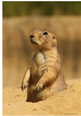
Diteš (ditish) Prairie Dog