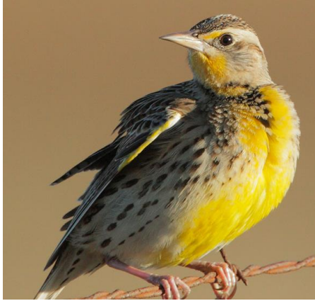
Si·su ti·yeli? Meadow Lark