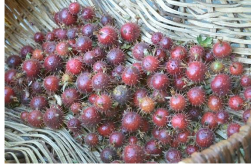
Sewit yogil (seh-woot-yagool)