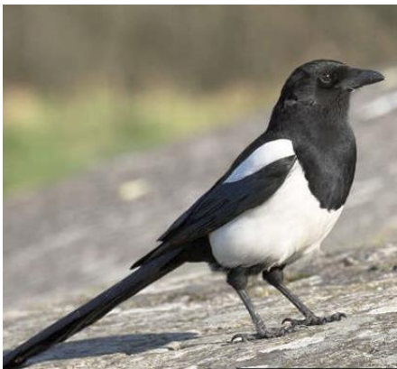
Taʔtat (tah-tat) Magpie