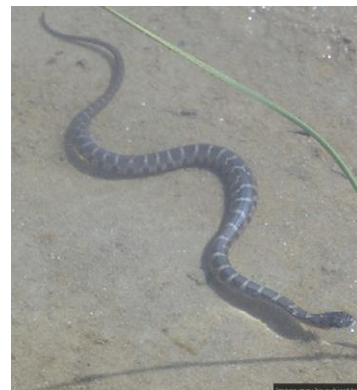
Mušgulhu (mooshgul-hoo) Watersnake