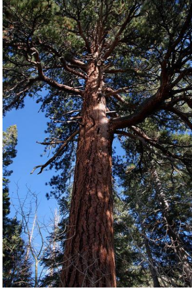
Ma·daš dewdiʔiš (mah-dash dow-dee-esh) Jeffrey Pine Pinus jeffreyi