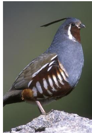
maduma?ti Mt. quail