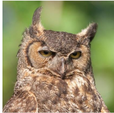
Dimim (dim-oom) Owl