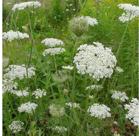
Dime? de-guš (dimeh-day-goosh) Water Hemlock Cicuta occidentalis