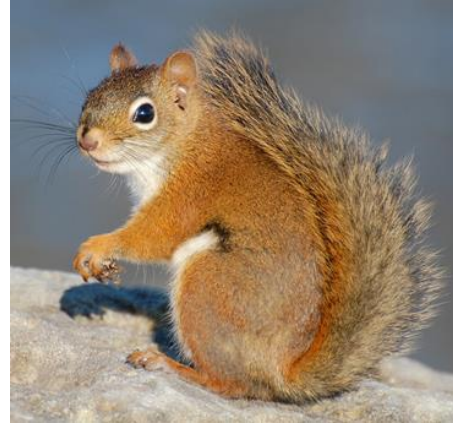
Ba·sat Red Squirrel