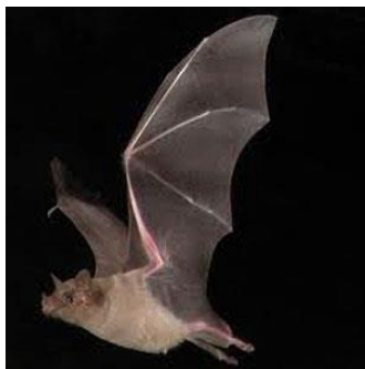
Bagumdalŋi (bagoom-dal-ngeh) Bat