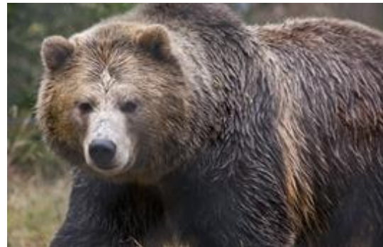
Taba? (tah-bah) Grizzly Bear