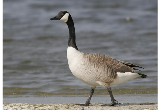
Gowgow Canadian goose