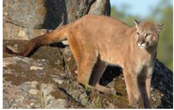
Hili·za? (hil-eezah) Mt Lion