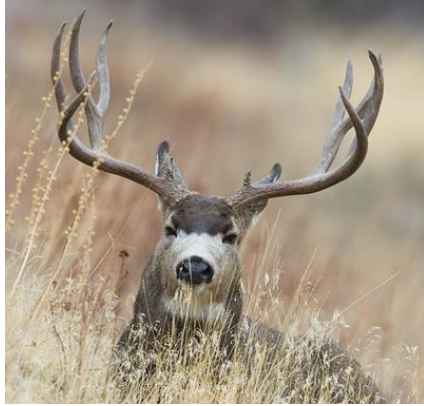
Memdewi Demesu-yi? Mule deer