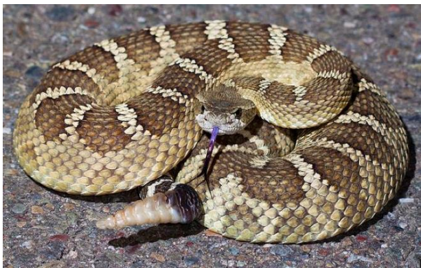
Maʔki (mah-keeh) Rattlesnake