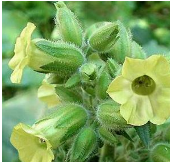
Wašiw Baŋkuš (Washiw bang-kush)