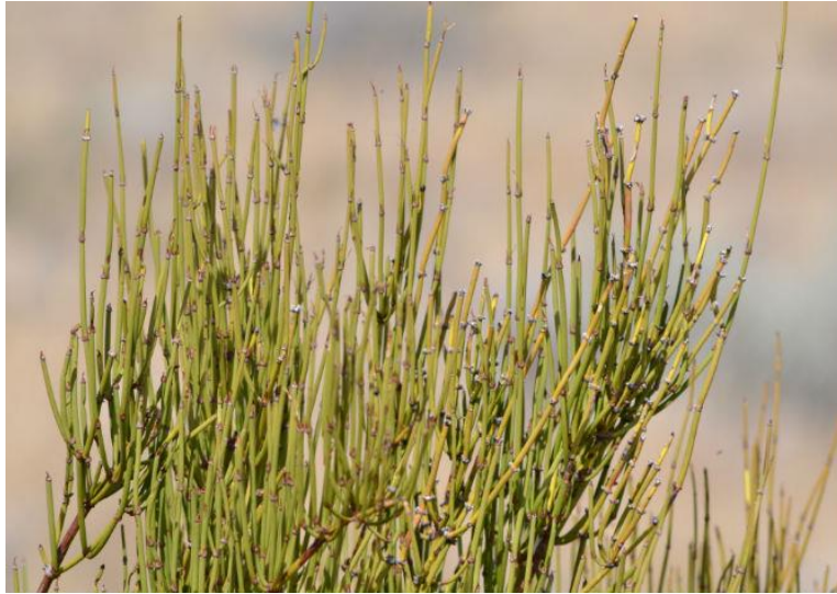
Me-gal (Meg-ell) Indian Tea, Mormon Tea ephedra viridis