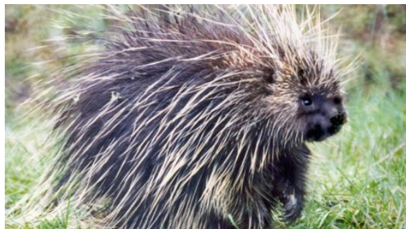
Sewit (seh-woot) Porcupine