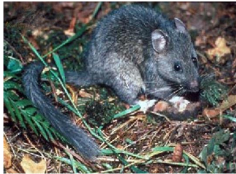
Pašaʔ Bushy tailed wood rat