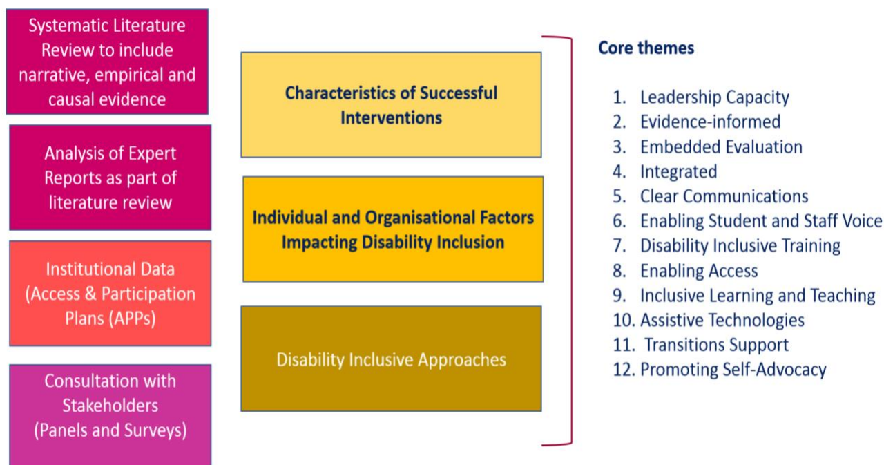
Figure 1: Rapid Evidence Review Components