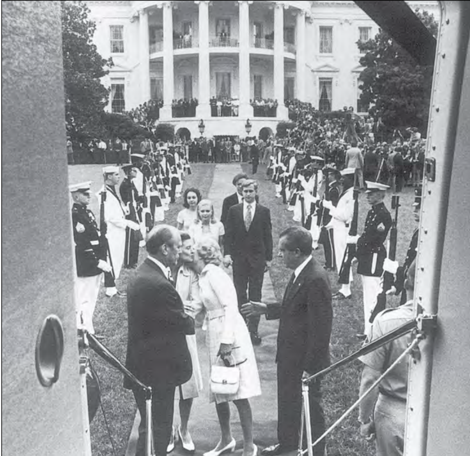
On August 9, 1974, President Nixon prepared to board a helicopter and depart from the White House after resigning. He extended his hand to Gerald Ford, his successor as president.

On July 24, 1974, the Supreme Court issued a unanimous decision in U.S. v. Nixon . The court upheld an order requiring President Richard Nixon to produce tapes of 64 conversations with four of his top aides. One of those tapes—the “smoking gun”—resulted in a firestorm of indignation in Congress and throughout the nation. Two days later, the House Judiciary Committee voted to impeach the president. On August 9, the president resigned—the first president in U.S. history to do so.