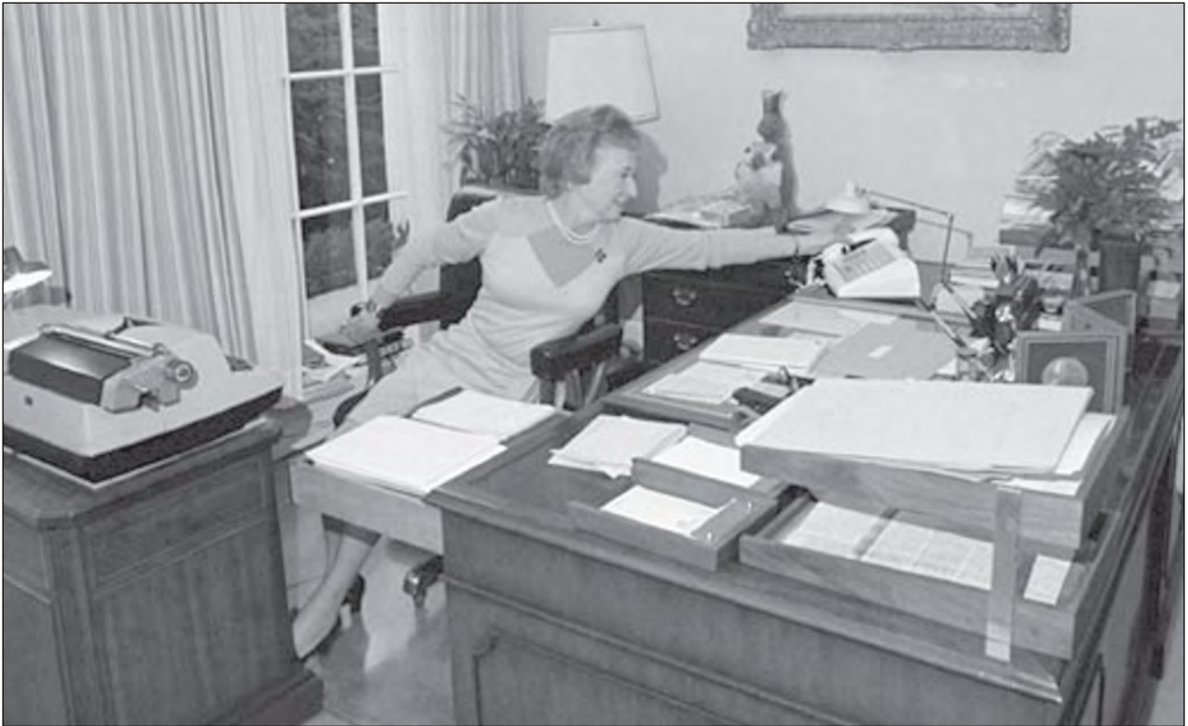
Rose Mary Woods, Nixon's secretary, demonstrated how she might have accidentally erased part of a tape important to the Watergate scandal.

privilege—one that is not limited—and should therefore not be turned over to the special prosecutor. The president's counsel argued that the president, as chief executive, had decided that tapes of confidential communications between himself and his advisors were privileged. The court, he said, should defer to the president's decision. The president's counsel argued that executive privilege was "part and parcel" of the separation of powers. He pointed out that the privilege "necessarily includes the right of the holder of the privilege to decide when it is to be exercised." The question, according to the president's counsel, was "who decides" when to exercise it. The answer, he argued, is "that it is for the Chief Executive, not for the judicial branch, to decide when the public interest permits disclosure of Presidential discussion."