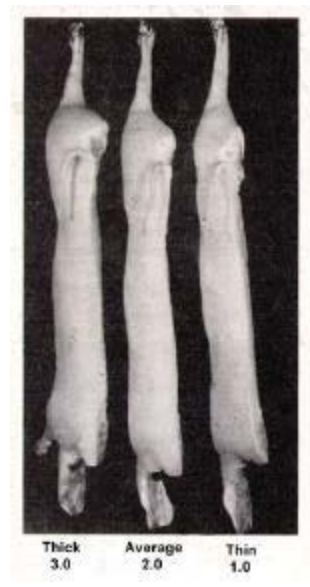
Figure 4. Muscle scores used to determine U.S. Grades

The muscle scores range from 1-3 with 3 being thick, 2 moderate, and 1 is thin. Figure 4 shows the muscle scores from swine carcasses.