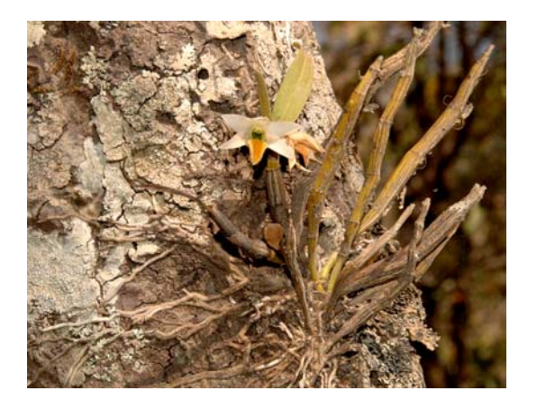
FIGURE 1. A flowering plant of D. scabrilingue growing on a tree trunk densely covered with lichens.

generalizations of statistically well-supported information attained from common species to the rare, where information on the roles of dispersal, germination and disturbance regimes for controlling population dynamics are desperately needed, for example for in situ conservation and for re-introduction programmes.