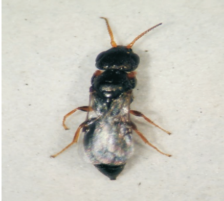
D. Adult female of G. nephantidis Plate 1: Biology of G. nephantidis on G. mellonella