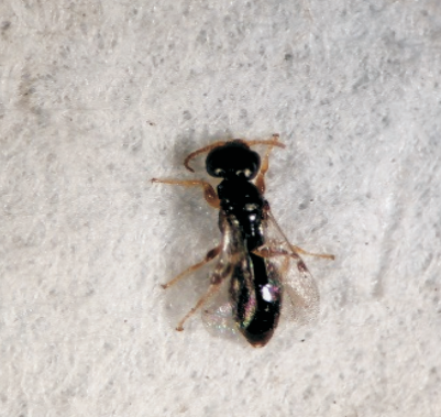
E. Adult male of G. nephantidis