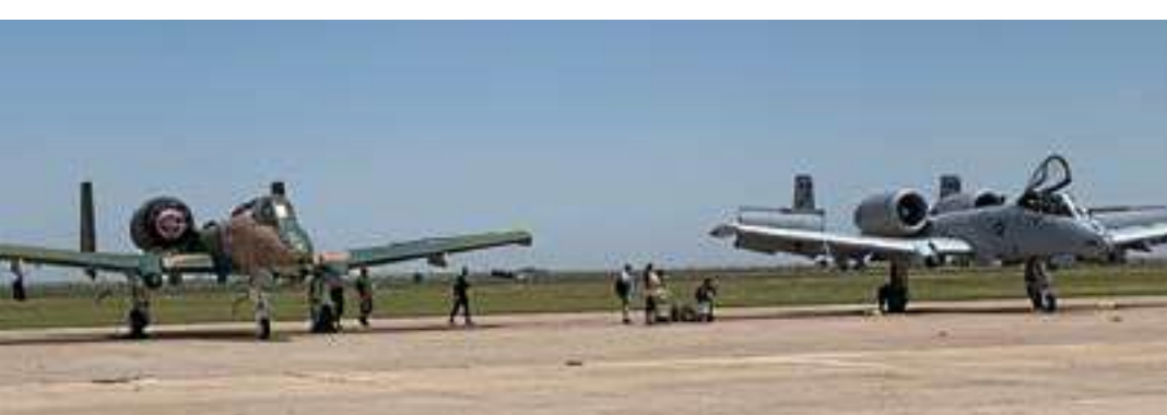
Dalhart Texan Archives