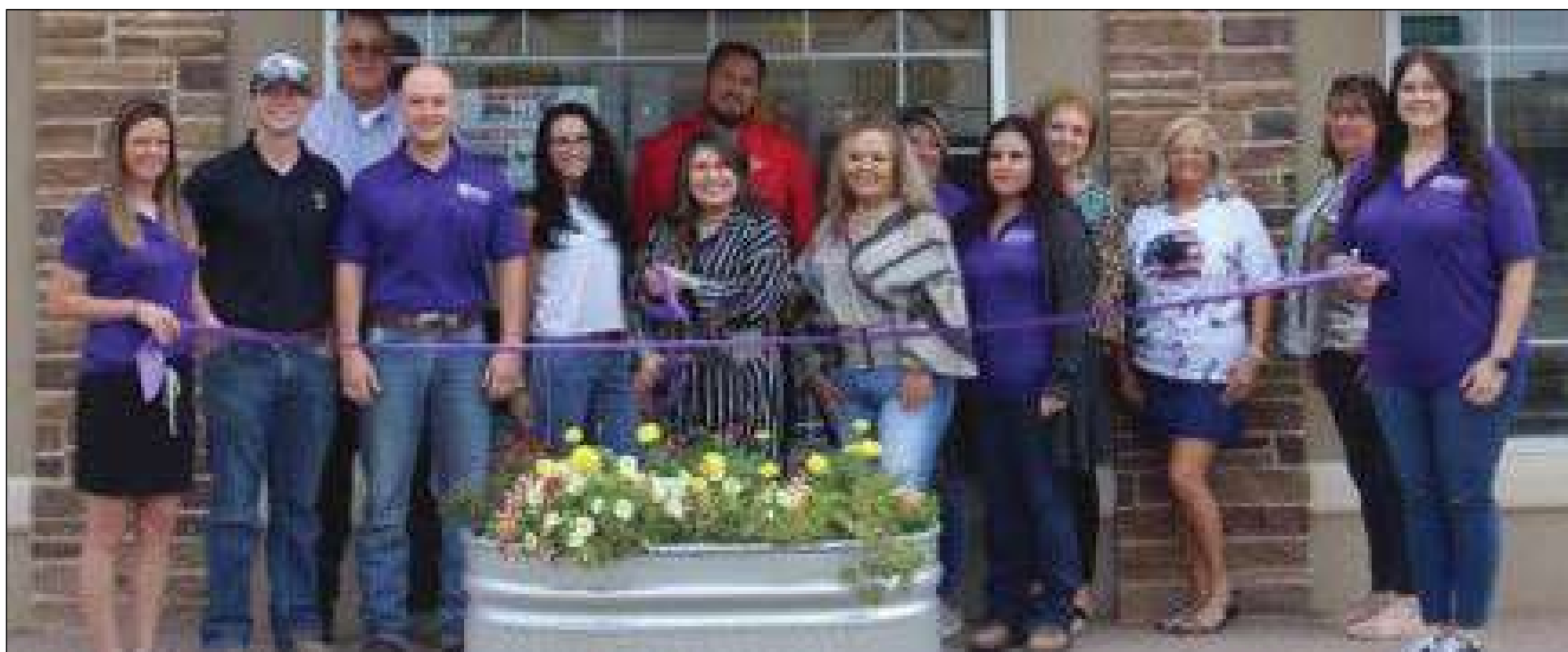
Dalhart Texan Archives

The Dalhart Area Chamber of Commerce hosted a ribbon cutting on Wednesday August 4 to celebrate the grand opening of the Rusty Pearl Boutique.