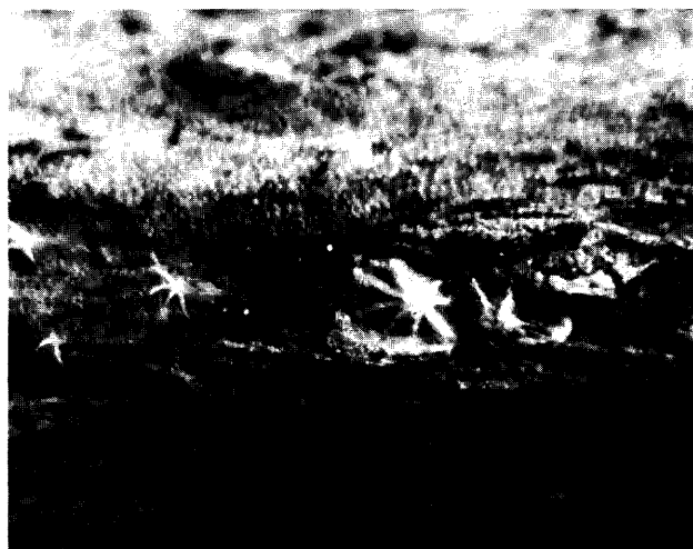
Fig. 2. Conchaspis angraeci , nymph with distinct ridges on armor (x20)

DISTRIBUTION : This scale insect is found throughout the tropics and subtropics. In Florida it has been reported from the following counties: Alachua, Baker, Brevard, Broward, Charlotte, Citrus, Dade, De Soto, Hillsborough, Jefferson, Lake, Lee, Leon, Levy, Manatee, Martin, Monroe, Orange, Palm Beach, Pinellas, Polk, and Volusia.