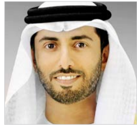
H.E. Suhail Al Mazrouei Minister of Energy & Infrastructure United Arab Emirates