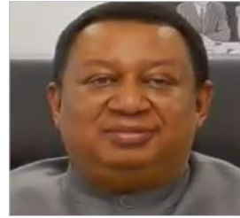
H.E. Mohammad Sanusi Barkindo Secretary General Organization of Petroleum Exporting Countries (OPEC)