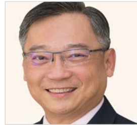
H.E. Gan Kim Yong Minister of Trade & Industry Singapore