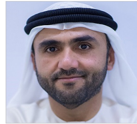
H.E. Yousif Ahmed Al Ali Assistant Undersecretary for Electricity - Water & Future Energy Affairs, Minister of Energy & Infrastructure, UAE