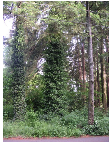
English Ivy, one of the most common invasive species.

For a list of invasive plant species in Virginia, please see the link for Invasive Alien Plant Species in Virginia at http://www.dcr.virginia.gov/natural_heritage/documents/invlist.pdf .