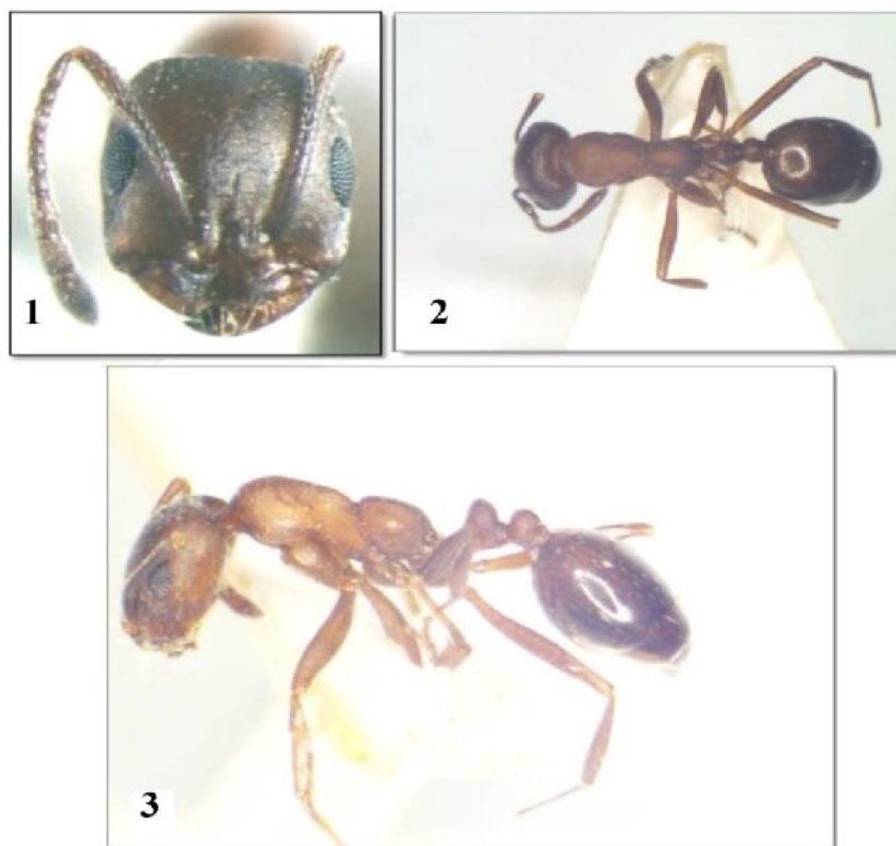
Figs. (1-3) Monomrium indicum Forel, 1902 (1) Head; full face-view (2) Body; dorsal view (3) Body, in profile

Conservation Status of M. indicum and M. sagei : During present study M. indicum was found in association with Aphis gossypii on Parthenium hysterophorus (Parthenium weed) and Setaria viridis (Green Foxtail) from Kamrial and on Ak plant from Charra Pani and with Aphis fabae from district Rawalpindi. Similarly M. sagei was also observed while workers were foraging on different host plant such as Psidium guajava (Guava), Cestrum nocturnum (Night-blooming jasmine), Solanum nigrum (Black nightshade) and Spinacia oleracea (Spinach) in various localities of Rawalpindi and Islamabad. However these host plants of above mentioned insects are highly in threat of extinction due to rapid road development in village areas of district Rawalpindi and Islamabad. Similarly development of housing societies in these areas also playing a key role in the destruction of these weeds and plants by turning agriculture land into housing structure. Due to these activities population of various plants species decreasing day by day. In order to conserve these plant and its associated communities of insect, strong efforts must be made at government level. These conservation activities will ultimately conserve M. indicum and M. sagei too