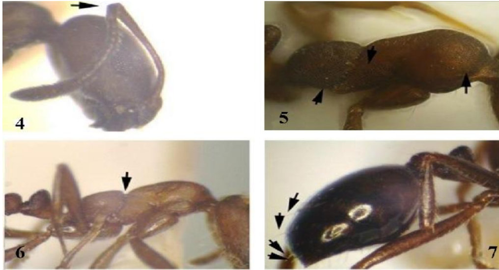
Figs. (4-7) Monomrium indicum Forel, 1902 (4) Scape short hardly crossing beyond the top of head (5) Mesosoma strongly rugose in profile view (6) Well developed metanotal groove (7) Gaster smooth and shining having erect and suberect hairs.