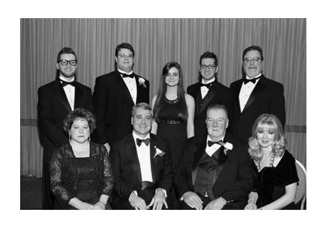
The Alger Family