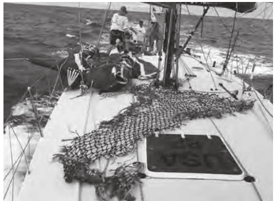
The Ocean Cleanup performing ocean plastic research in the Great Pacific Garbage Patch during the Mega Expedition, Summer 2015