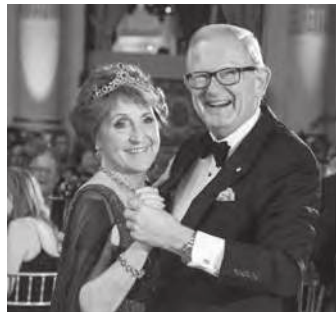
Opening dance with Her Royal Highness Princess Margriet of the Netherlands and Professor Pieter van Vollenhoven