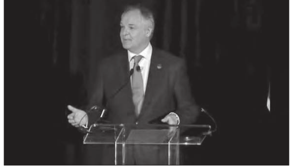
Unilever CEO Paul Polman delivering the Freddy Heineken Lecture on Capitol Hill