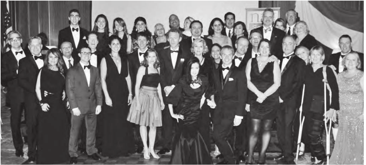
Guests at the Dutch American Heritage Day Gala