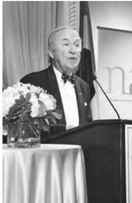
Awardee Rodney P. Frelinghuysen