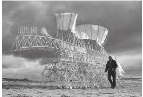
Strandebeest: The Dream Machines of Theo Jansen