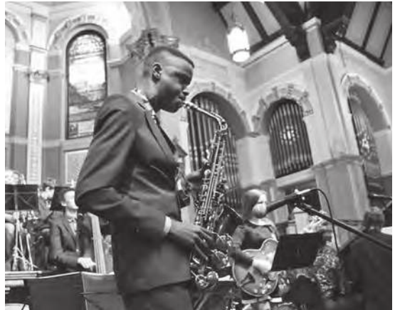
Junior Jazz Unlimited Bigband performance at West End Collegiate Church, New York City, October 2015

To support Arise Kampen on a tour entitled Arise to LA to Los Angeles in 2015. In 2014, the Los Angeles-based Episcopal Chorale traveled to the Netherlands and performed with Arise Kampen. Arise Kampen in turn traveled to the U.S. in 2015 to again perform with Episcopal Chorale. The focus was on cultural exchange between the choirs by performing works by Händel and Vivaldi, gospel and negro spirituals of Episcopal Chorale and the gospels and Close Harmony of Arise Kampen.