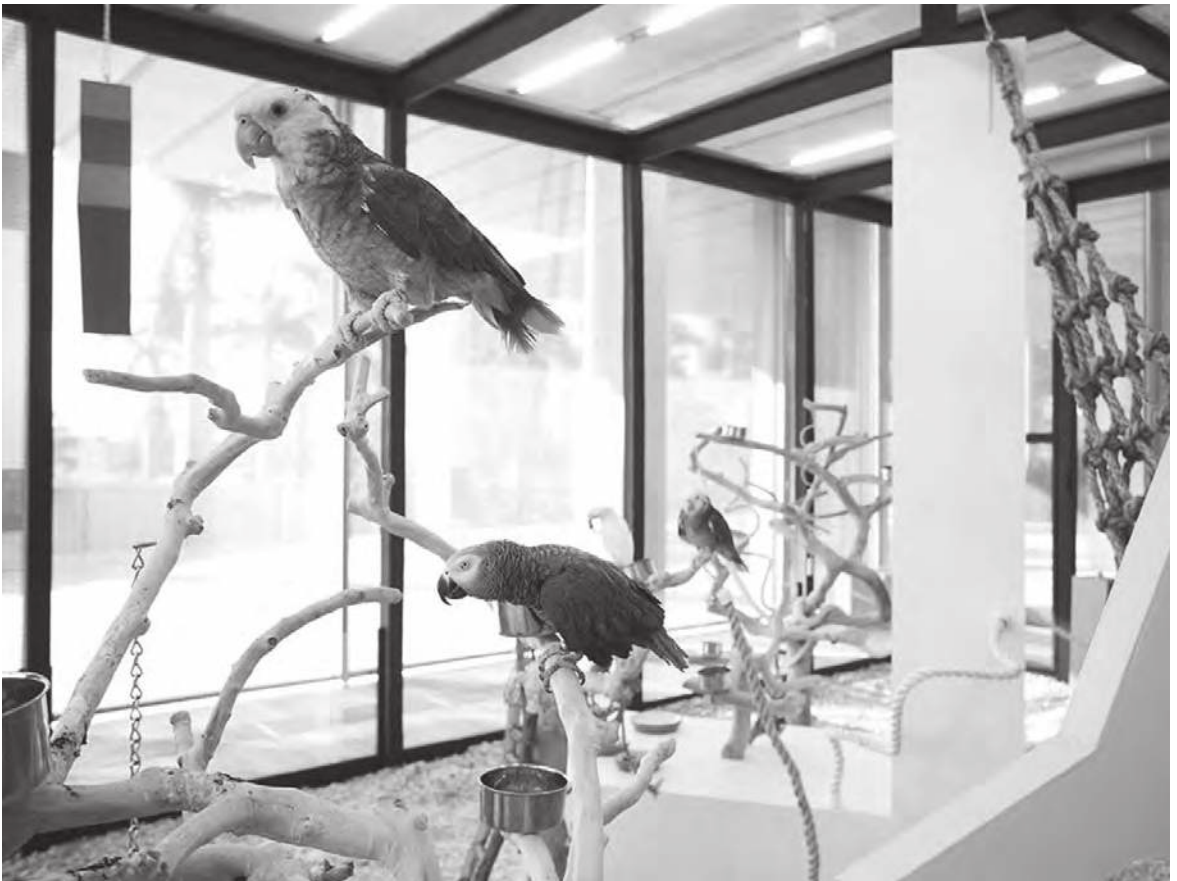
Installation shot of Speechless at the Perez Art Museum Miami