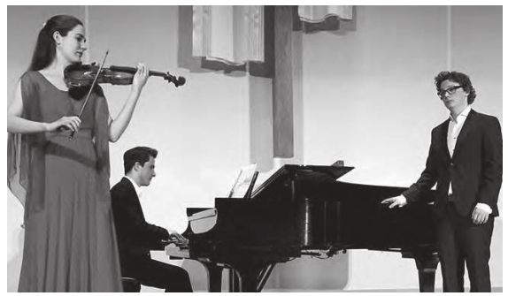
2015 Princess Christina Concours performance in Los Angeles