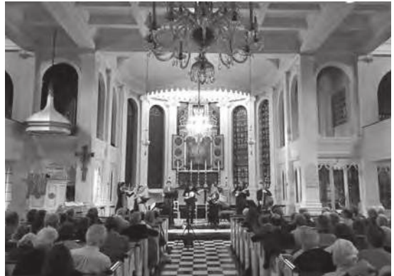
Early Music Foundation performance at Corpus Christi Church, New York City, October 2015