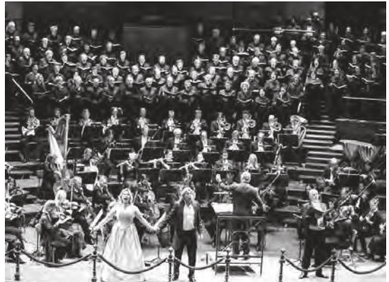
Performance of Lohengrin by Wagner by the Royal Concertgebouw Orchestra in December 2015