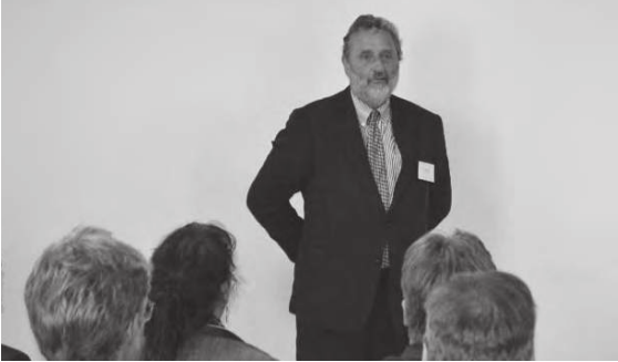
Send-off for His Excellency Henne Schuwer, Ambassador of the Netherlands to the U.S., organized by NAF-Biz NL