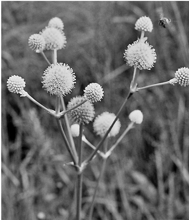
Pale purple coneflower (Echinacea pallida) (top) and Rattlesnake master (Eryngium yuccifolium) (bottom), species of limited range in Wisconsin. All natural populations are within approximately 50 miles of the Illinois-Wisconsin state line.