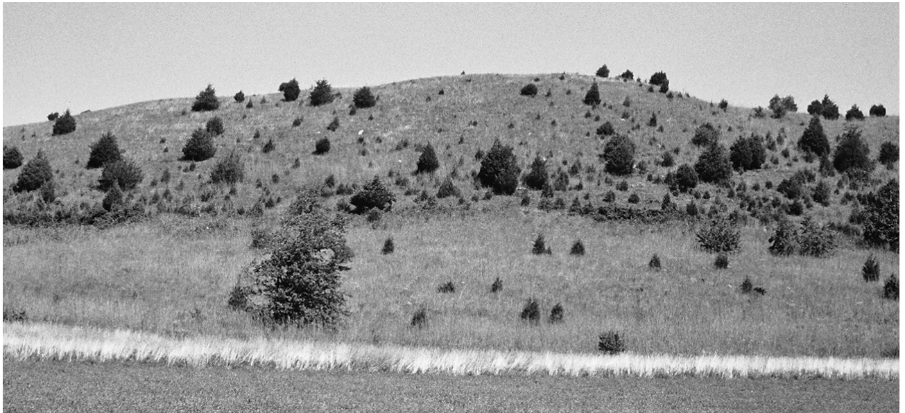
Hawk Hill, Dane County. An example of dry prairie on rocky bluffs.