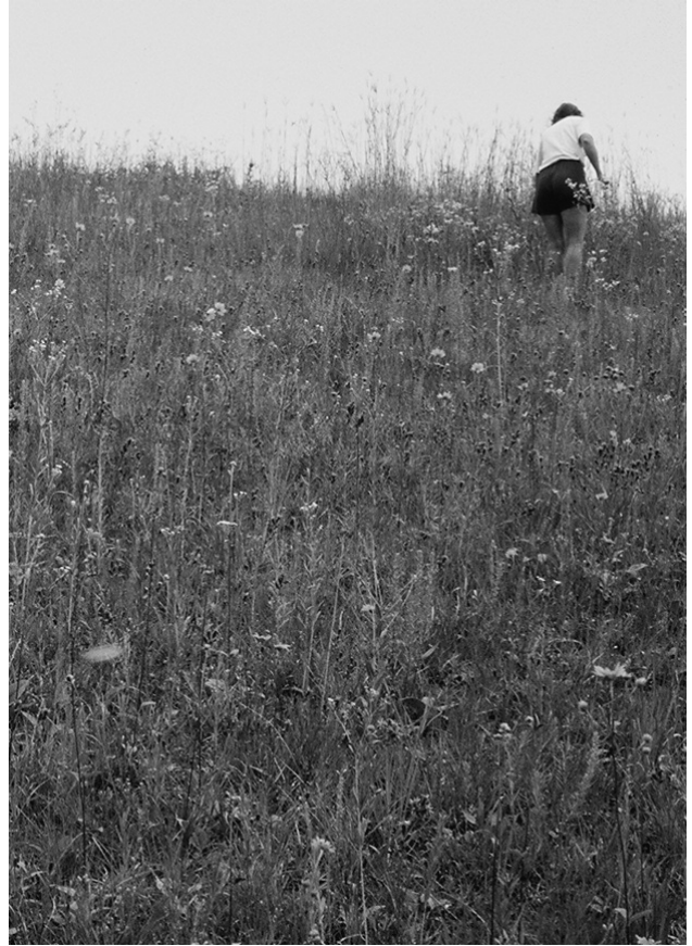
An example of dry prairie on gravelly morainal till, in Dane County.

Nomenclature follows Gleason and Cronquist (1991) with two exceptions; Aster urophyllus is used in place of A. sagittifolius and Platanthera is used in place of Habenaria . In these cases nomenclature follows the preference of the University of Wisconsin-Madison Herbarium.