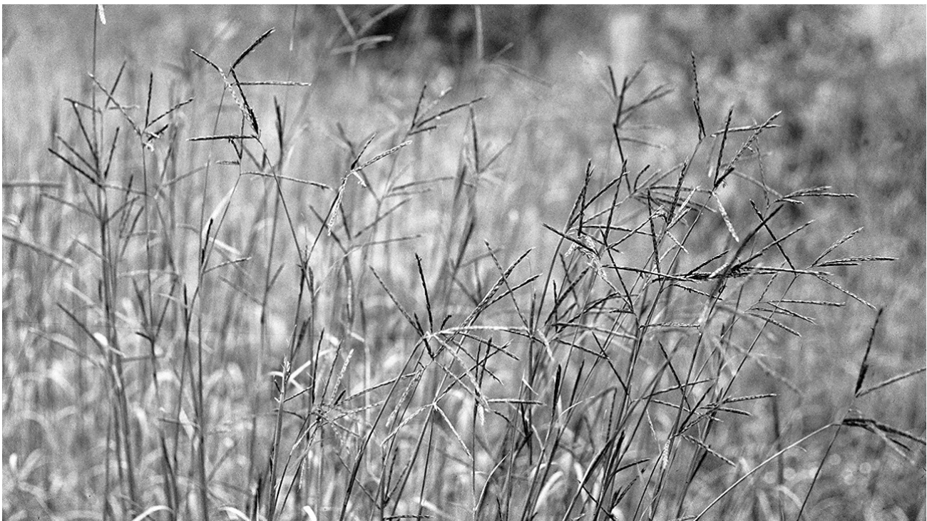
Big bluestem (Andropogon gerardi), a dominant grass in prairies. This is another of those aggressive species that should be seeded in proportions far less than the data in the tables suggest.