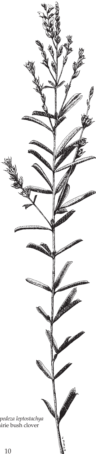
Lespedeza leptostachya Prairie bush clover