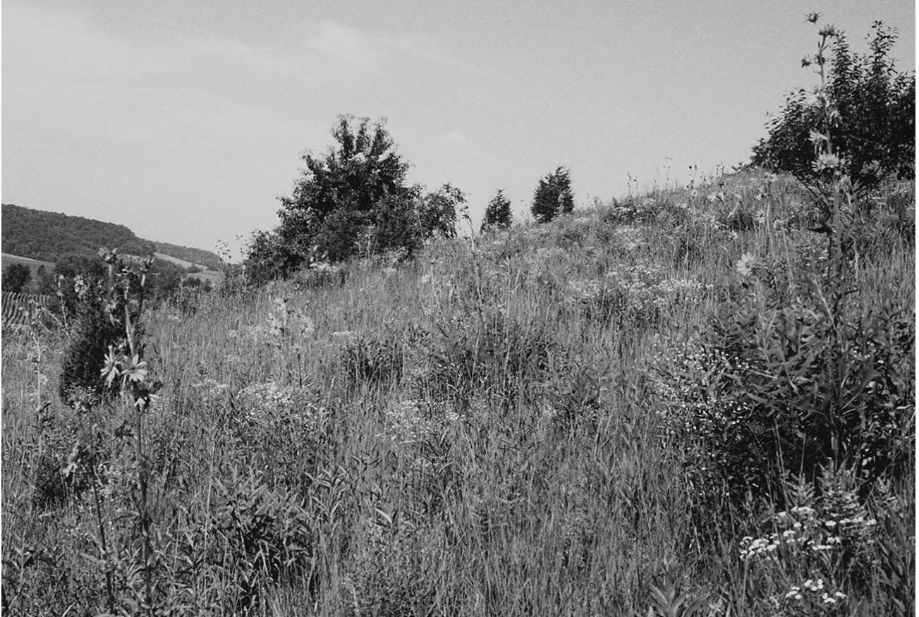
An example of dry-mesic prairie on morainal till with characteristic Compass plants ( Silphium laciniatum ).