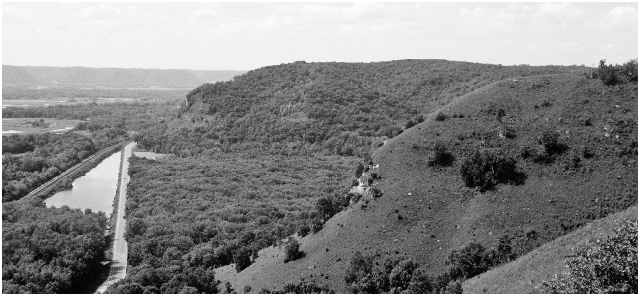
Rush Creek State Natural Area, Crawford County. An example of dry prairie on rocky bluffs.