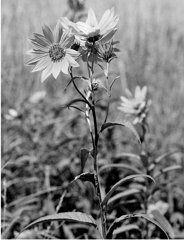
Sawtooth sunflower (Helianthus grosserratus). All Helianthus spp. are aggressive spreaders by rhizomes that should be seeded in proportions far less than the species composition tables indicate.