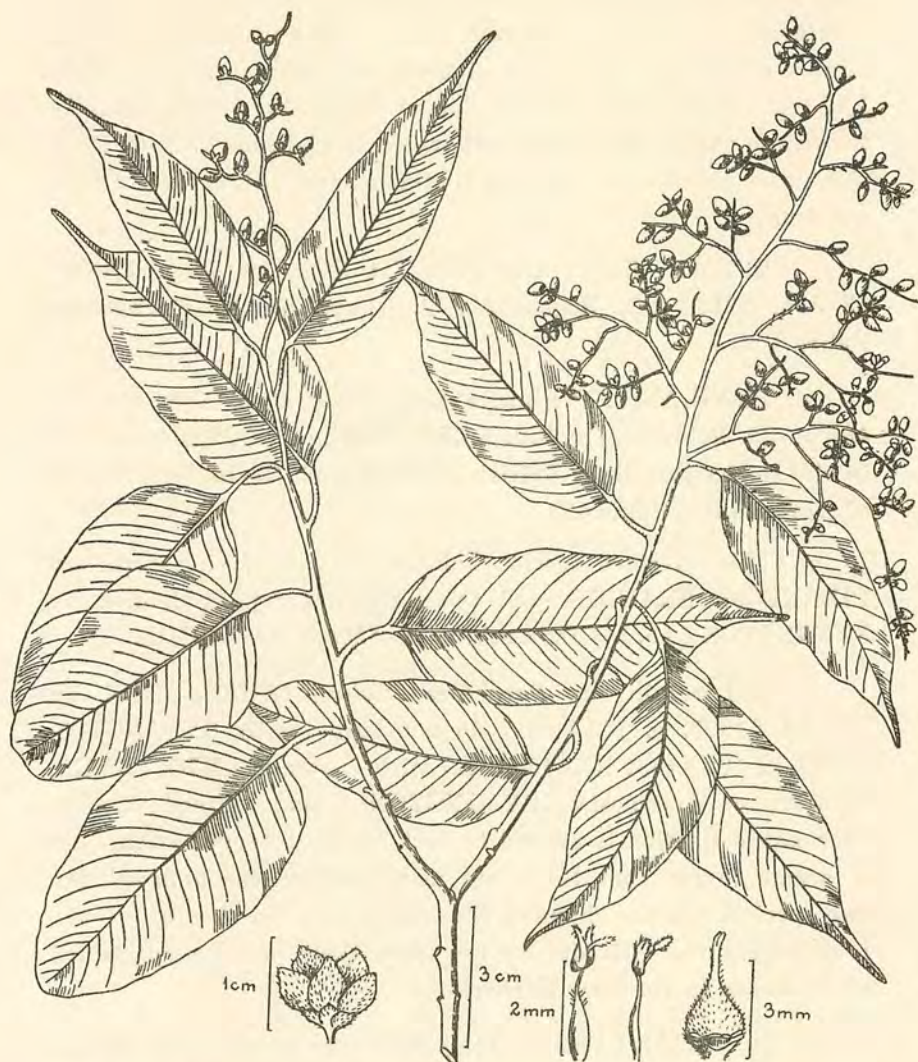
Fig. 1. Shorea rogersiana RAIZADA & SMITINAND. Specimen from Tavoy (C.G. Royers 350 T, TYPE).

long, 3,5–4 mm wide, 2–3 times the calyx. Stamens about 40–45 (30–36) up to 2–2,5 mm long, filaments long and slender, some of them slightly broadened above the base, up to 1,25 mm long, anther about 5 mm long, bearded or covered