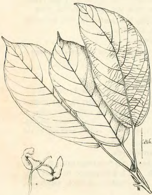
Fig. 3. Shorea hemsleyana (KING) KING ex FOXW. A. Young shoot. B. Germinating seed.