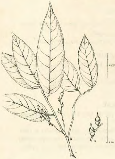
Fig. 1. Hopea reticulata TARD.—BLOT A. Twig showing inflorescence. B. Young fruits enlarged.