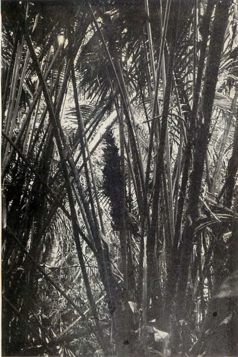
Eugeissona tristis GRIFF. Waeng, Narathiwat close up of fruits.