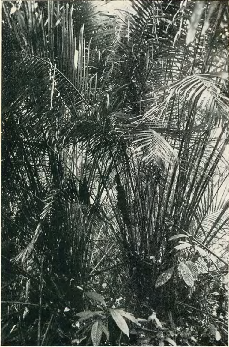
Eugeissona tristis GRIFF. Waeng, Narathiwat Showing habitat.