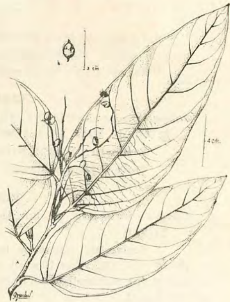
Fig. 2. Hopea aff. reticulata TARD.—BLOT A. Twig showing inflorescence. B. Young fruits enlarged.