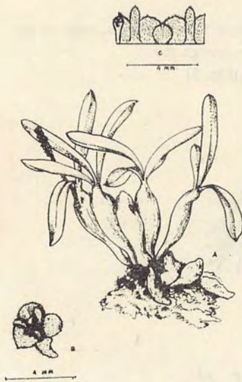
Fig. 6. ERIA MERGUENSIS LINDL. A. Whole plant. B. Fl. enlarged. C. Detail of flower.

Burma (Moulmein), Thailand. A live specimen was sent for identification in August 1957. The flower is pinkish purple with yellow median ridge, It is locally known as Kulap thawai (กุหลาบทะวาย) (Fig. 7).