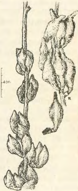
Fig. 4. Dysoxylum Urens VAL.