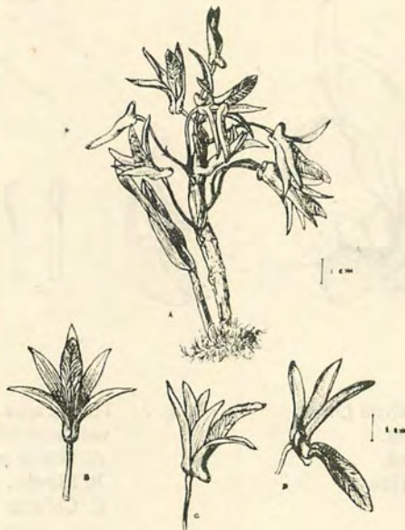
Fig. 5. Dendrobium arachnites RCHB.F.

Burma (Moulmein), Thailand and Laos. (Fig. 5)