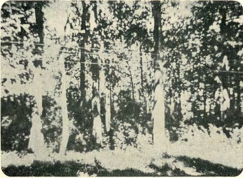
Figure 4. Tectona grandis forest type.