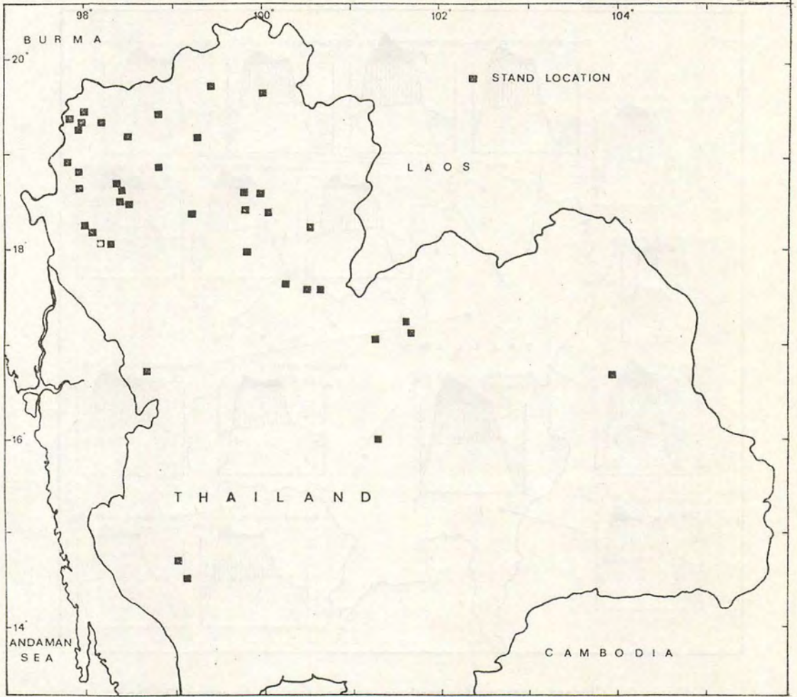
Figure 1. Locations of sample stands.