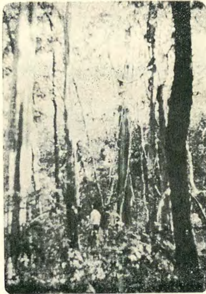
Figure 5. Lagerstroemia calyculata forest type, Huai Kha Khaeng Wildlife Sanctuary, Uthaihani Prov.