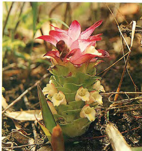
Figure 3. Curcuma zedoaria (Berg.) Rosc. (Zingiberaceae), deciduous, perennial, aromatic herb which is edible and very common during the dry season, flowers when leafless. Photo: Wangworn Sankamethawee 4 May 2001.