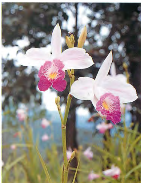
Figure 5. Arundina graminifolia (D. Don) Hochr. (Orchidaceae), perennial, deciduous, ground orchid, which is found more often than other orchids. Photo: Wangworn Sankamethawee 10 August 2001.