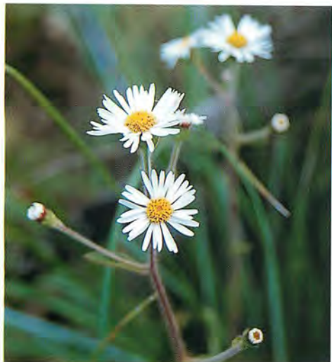
Figure 2. Inula nervosa Wall. ex DC. (Compositae), one of the commonest species in this family. Photo: Wangworn Sankamethawee 15 November 2001.