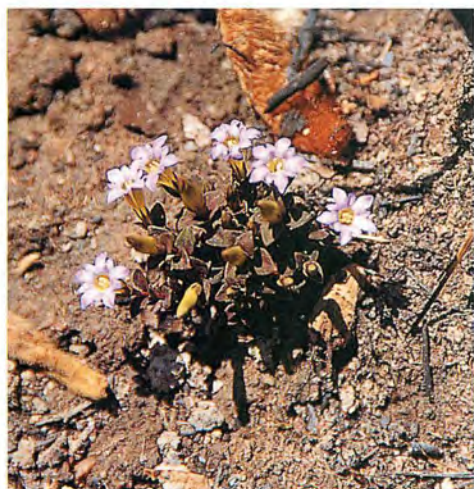
Figure 4. Gentiana timida Kerr. (Gentianaceae), a deciduous ground herb with dimorphic leaves, corolla closes in mid-afternoon. Photo: Wangworn Sankamethawee 4 May 2001.