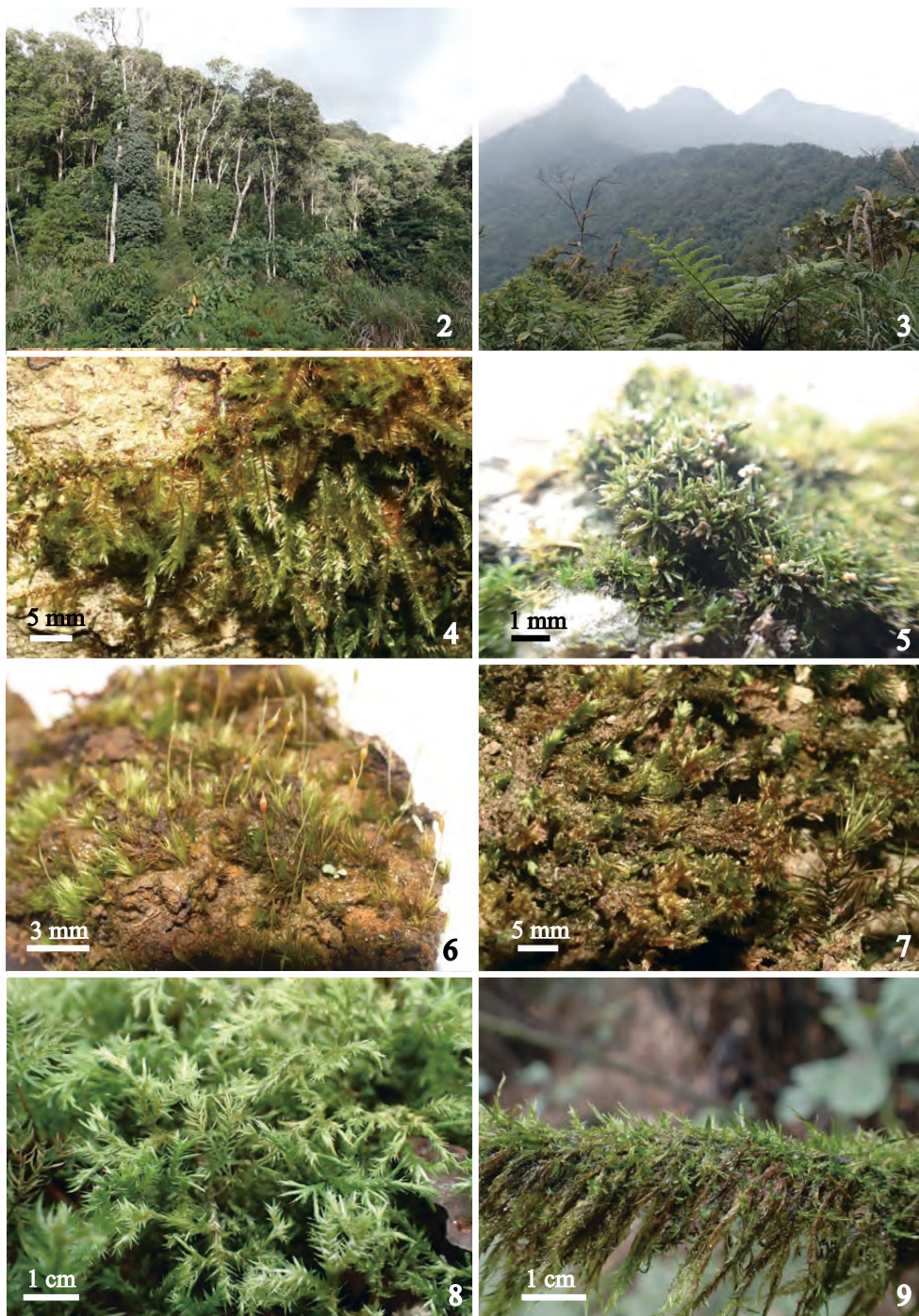
Figures 2–9. 2: Bidoup–Nui Ba National Park, in the vicinity of Giang Ly Forest Station. 3: Tam Dao National Park showing the three peaks (namely Tam Dao 1, 2 and 3). 4: Clastobryum oligonema . 5: Holomitrium vaginatum . 6: Microdus brasiliensis . 7: Symphiodon scabrissetus . 8: Trismegistia calderensis var. rigida (condensed type as in Akiyama 2010). 9: Yakushimabryum subintegrum .