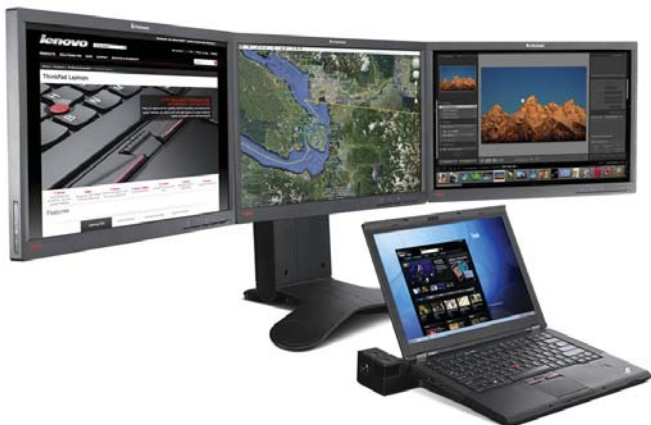
ThinkPad triple external monitor configuration using NVIDIA's Optimus technology