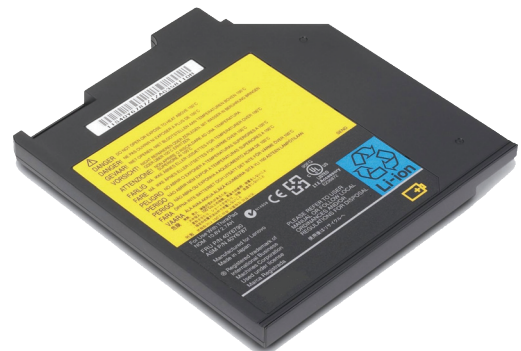
ThinkPad Battery 42 (3-cell, bay) 57Y4536