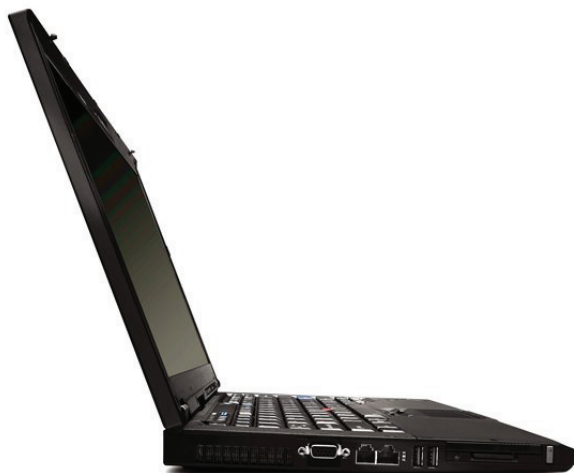
Lenovo ThinkPad T400