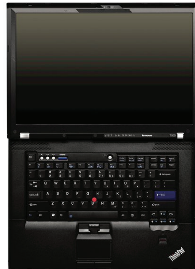
Lenovo ThinkPad T500