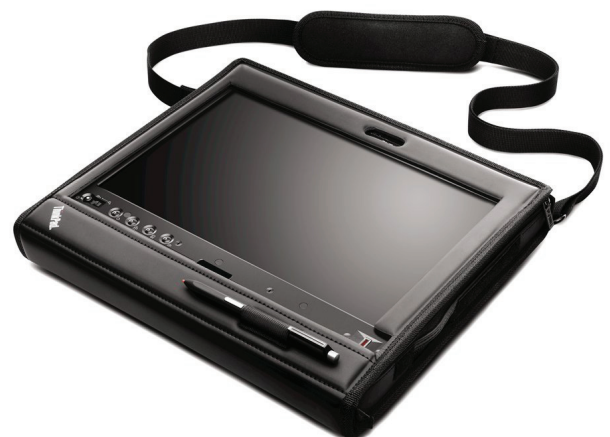
Lenovo ThinkPad X200 Tablet with ThinkPad X200 Tablet Sleeve 43R9115