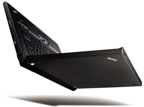
Lenovo ThinkPad W500