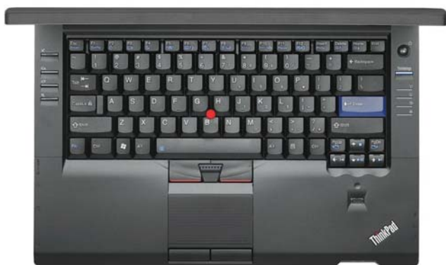
Lenovo ThinkPad L412