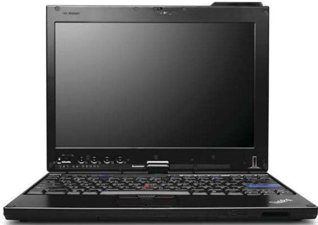
Lenovo® ThinkPad X201 Tablet