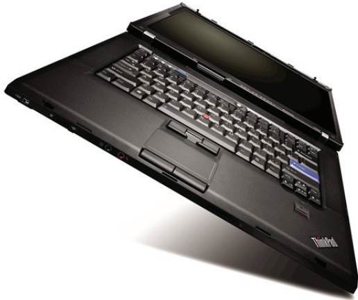
Lenovo ThinkPad W500