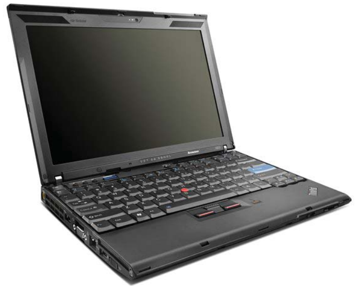
Lenovo ThinkPad X201 (TrackPoint model)