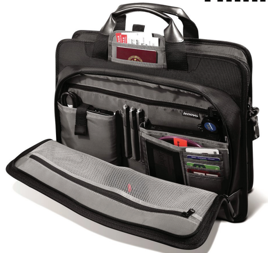
ThinkPad Business Topload Case 43R2476