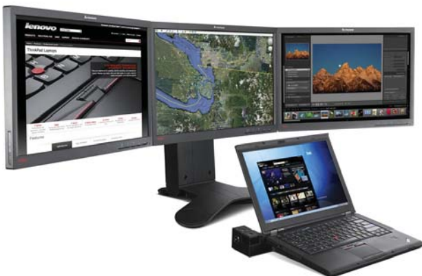
ThinkPad triple external monitor configuration using NVIDIA's Optimus technology