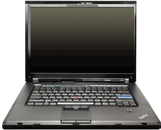
Lenovo® ThinkPad W500