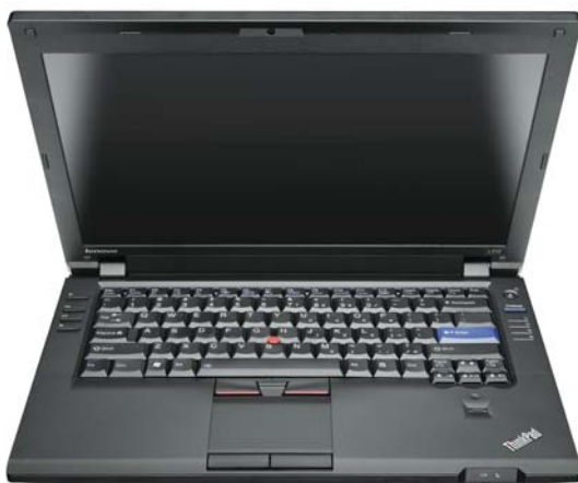
Lenovo ThinkPad L412