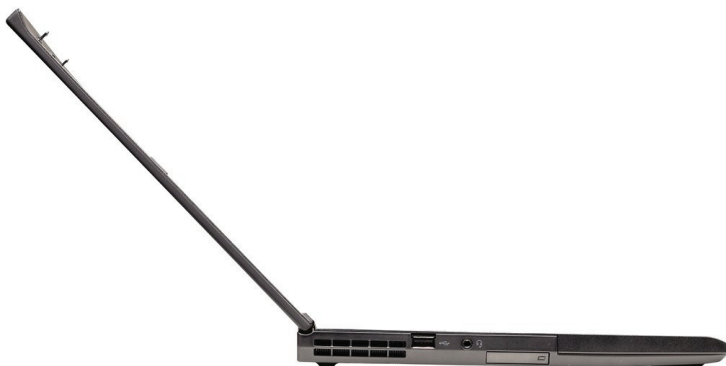
Lenovo ThinkPad T400s