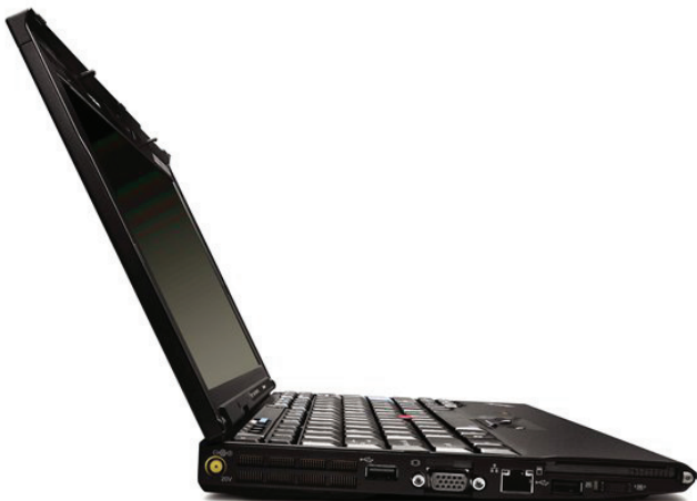
Lenovo ThinkPad X200