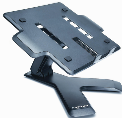
Lenovo Essential Notebook Stand 45J9292