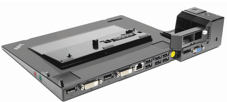
ThinkPad Mini Dock Plus Series 3 433810U