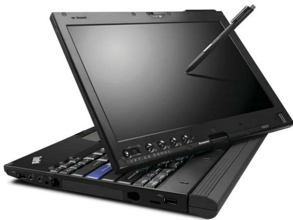
Lenovo ThinkPad X201 Tablet