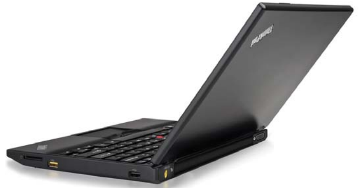
Lenovo ThinkPad X120e