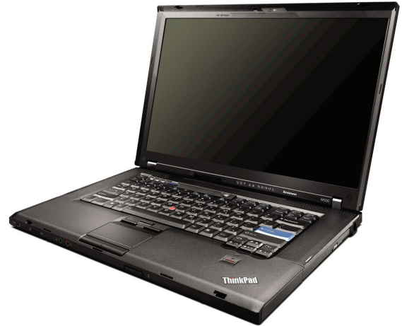
Lenovo ThinkPad W500