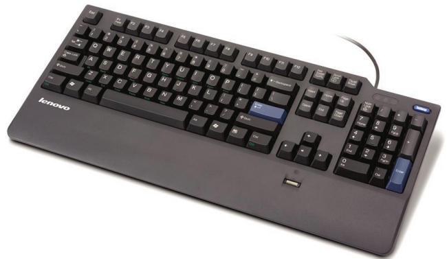
Lenovo USB Fingerprint Keyboard 73P4730