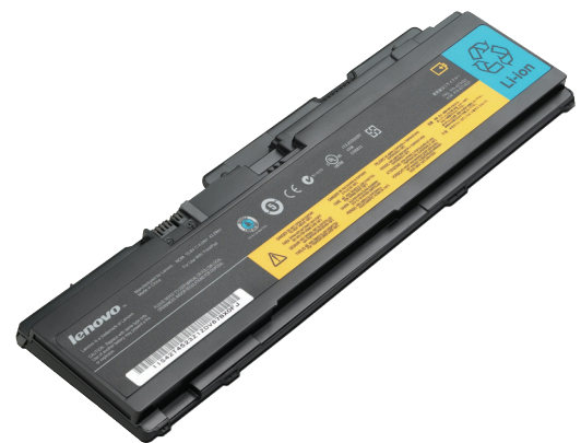
ThinkPad Battery 59+ (6-cell) 51J0497