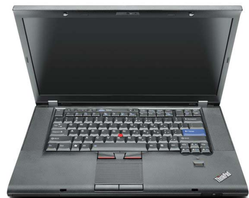
Lenovo ThinkPad W510