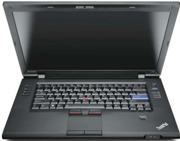
Lenovo® ThinkPad L512