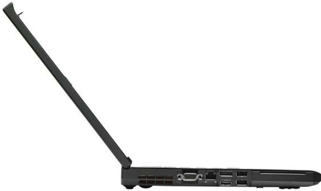
Lenovo ThinkPad T410