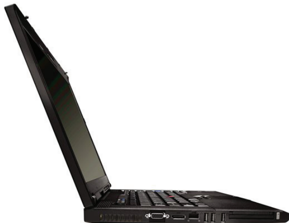
Lenovo ThinkPad T500