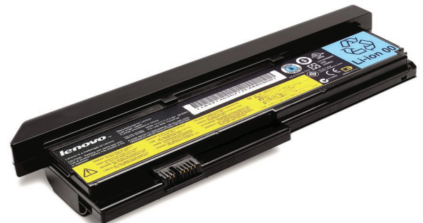
ThinkPad Battery 47++ (9-cell) 43R9255