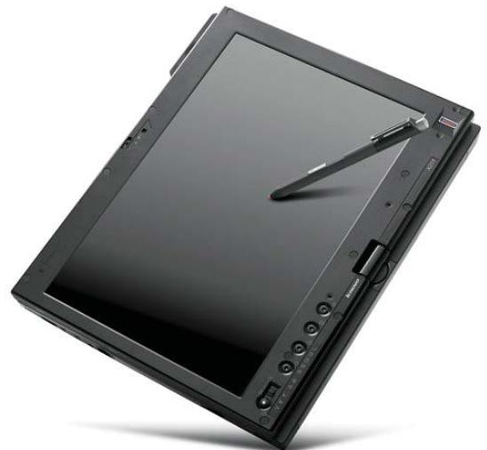
Lenovo ThinkPad X201 Tablet