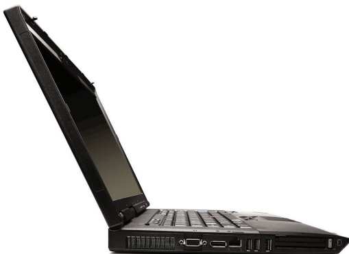
Lenovo ThinkPad R500