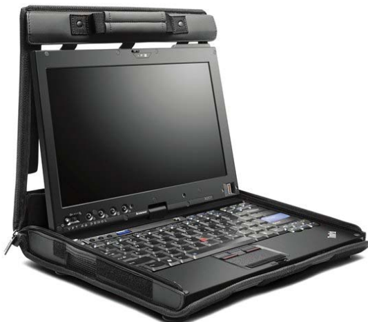
Lenovo ThinkPad X201 Tablet with ThinkPad X200 Tablet Sleeve 43R9115