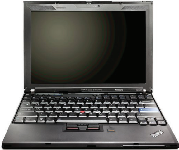
Lenovo® ThinkPad X200