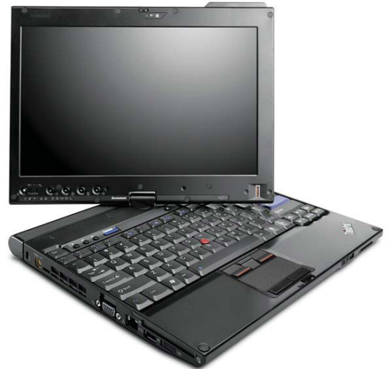
Lenovo ThinkPad X201 Tablet