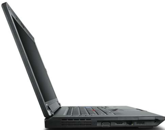
Lenovo ThinkPad L512