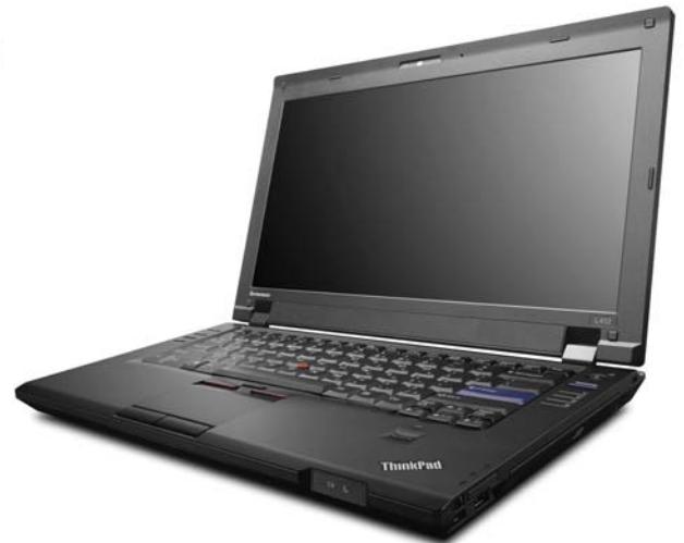
Lenovo ThinkPad L512