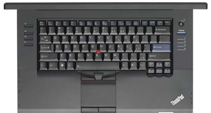
Lenovo ThinkPad L512