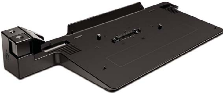
ThinkPad W700 Mini Dock 2.0 57Y4345