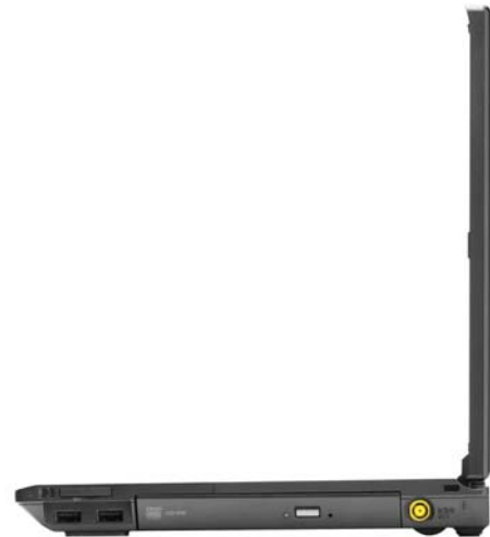
Lenovo ThinkPad L412