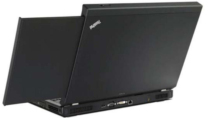
Lenovo ThinkPad W701ds