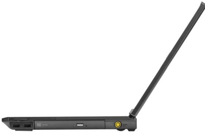
Lenovo ThinkPad L512