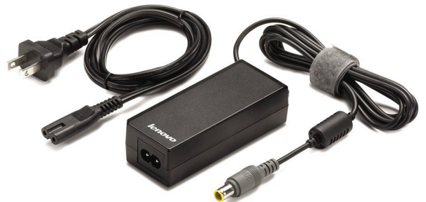
ThinkPad 65W AC Adapter 40Y7696