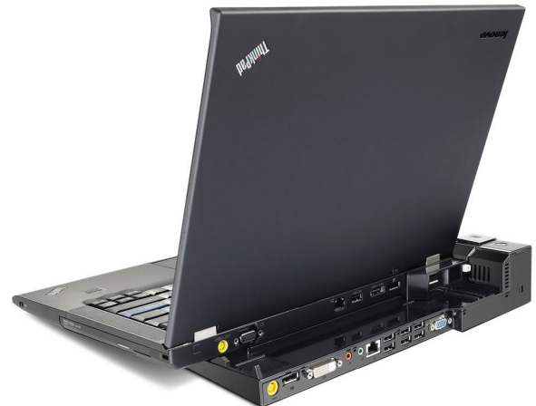
Lenovo ThinkPad T400s with ThinkPad Mini Dock Series 3 433710U