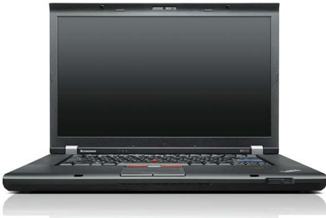
Lenovo® ThinkPad W510