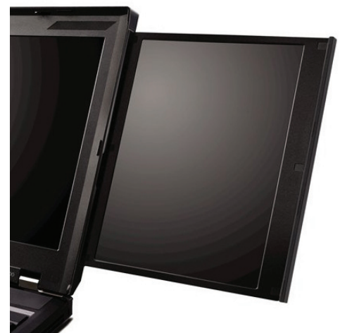
Lenovo ThinkPad W700ds