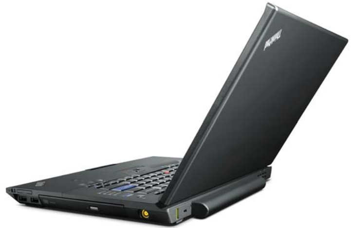
Lenovo ThinkPad L512 with ThinkPad Battery 55++ (9-cell) 57Y4186