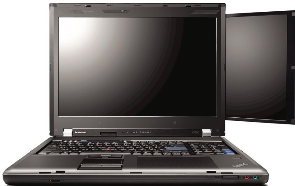
Lenovo ThinkPad W700ds