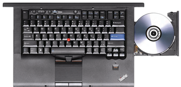
Lenovo ThinkPad T400s