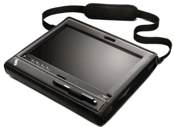
Lenovo ThinkPad X201 Tablet with ThinkPad X200 Tablet Sleeve 43R9115