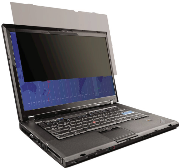
Lenovo ThinkPad T500 with T500/R500/W500 Series 15W Privacy Filter 43R2474