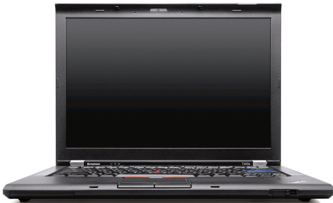
Lenovo® ThinkPad T400s