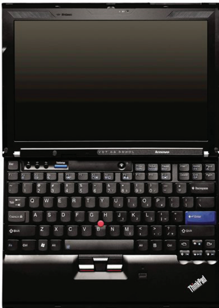
Lenovo ThinkPad X200