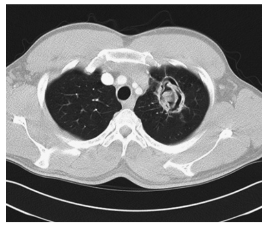
Figure 2 CT scan of the thorax showing a ruptured hydatid cyst in the left upper lobe of the lung.

In a small number of cases hydatid cysts resolve spontaneously.<sup>6</sup> In the majority of cases the treatment of choice is surgical excision of cysts with a view to preserve as much lung parenchyma as possible.<sup>7</sup> Albendazole should be avoided preoperatively as it may soften the cyst wall and increase the chance of rupture. It may be given as adjunctive therapy once the cyst has been removed.8 When surgery is contraindicated or not feasible in patients with multiorgan involvement, medical treatment with albendazole with or without praziquantel is recommended. Expert advice should be sought regarding chemotherapeutic regimens before and after surgery and for cases where surgery is not to be carried out. While aspiration followed by injection of a scolicidal agent and re-aspiration (PAIR) has been used as a therapeutic tool when surgery is contraindicated, 10 the World Health Organization states that PAIR is contraindicated for lung cysts<sup>11</sup> and the authors endorse that view.