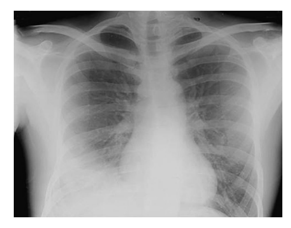
Figure 3 Chest x-ray showing right basal consolidation and pleural effusion secondary to amoebic liver abscess.

Ascariasis is caused by Ascaris lumbricoides , the round worm. It is common worldwide in areas with poor sanitation where there is faecal contamination of soil or food. Transmission of the disease is faecal-oral. After eggs are ingested they hatch and larvae migrate via the portal circulation to the liver then via the heart to reach the lungs 2 weeks after ingestion. Larvae then ascend to the trachea, are swallowed and eventually develop into adults in the small intestine, producing eggs 10–12 weeks after ingestion.