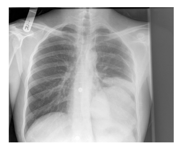
Figure 1 Chest x-ray showing a hydatid cyst in the left lower lobe with a collapsed hydatid cyst exhibiting the 'lily pad' sign lying above it.

Postoperatively, serological tests may be used to monitor the immunological response to treatment. ^{5}\,