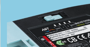
Lumen output switch