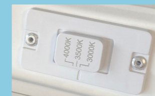
Colour temperature switch

There is no need to worry about lumen packages or colour temperatures anymore – it's always the same product and the adaption to your application can be done directly on site: