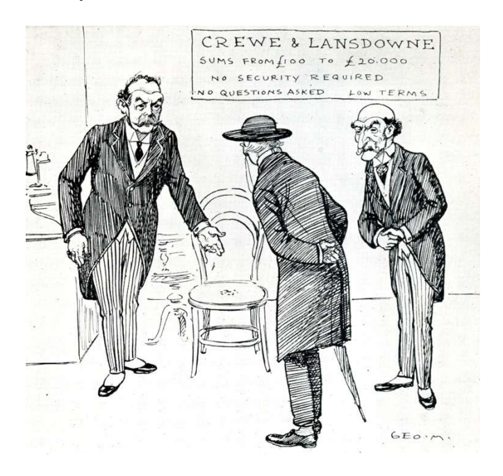
The Masked Money Lenders

February 2. Went to the Hippodrome with some of my family, and was so disgusted with the vulgarity and offensiveness of one of the turns, which exposed certain members of the audience to ridicule, that I wrote and expostulated with the management. They replied that the manager was abroad and that they would consult him on the subject when he returned. I then intimated that I was not prepared to wait until this gentleman returned, and that I should go to the Lord Chamberlain unless the turn was immediately withdrawn. They then capitulated at once. This little incident showed that objectionable exhibitions can be stopped by private individuals if they take the trouble to act.