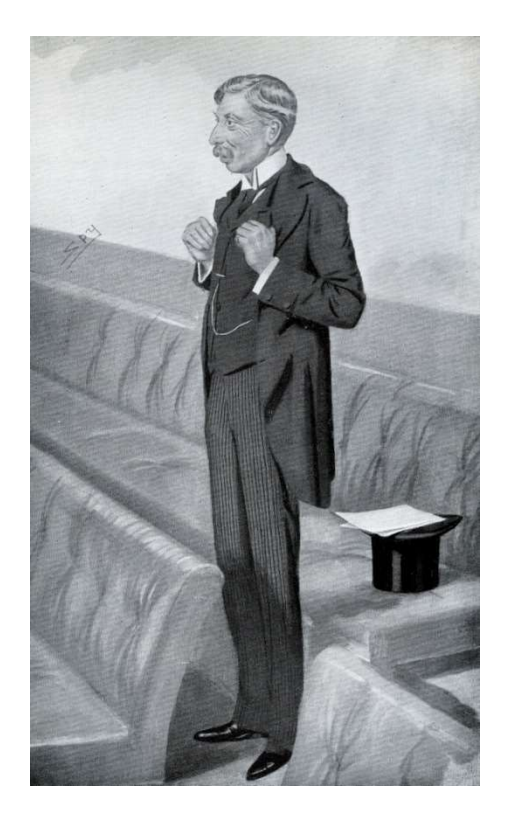
Cartoon of the Author, by Spy, published in Vanity Fair, 1908

December 15. The Miners' Eight Hours Bill had passed through the Commons and came up this day for Second Reading in the Lords. After considerable discussion, it had been agreed with the opponents that I should move the rejection, pro forma , and without the intention of throwing out the Bill, which would have been a reckless proceeding. I accordingly did so and had a curious experience. The Bill was so obviously a vote-catching measure, and the proposal to fix a