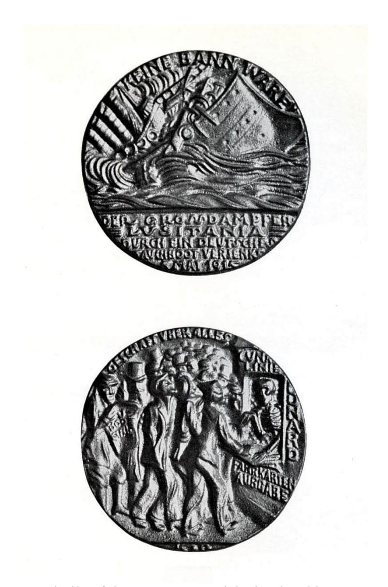
Facsimile of the Lusitania Medal, circulated in 1916