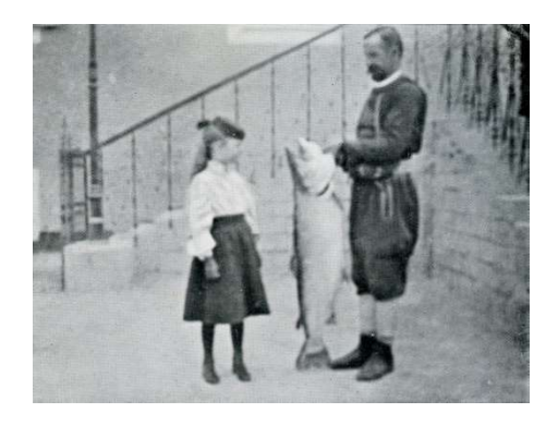
Photograph taken at the British Legation, Cettinje in 1898 of a trout estimated to weigh over 45 pounds

On arrival, there it was necessary to embark upon a large punt, and I had an opportunity of realising how much more intelligent a horse is in semi-civilised country as compared, for instance, with ours. Here they had to be embarked over piles of loose, jagged stones, over which it would have been insanity to lead one of our own horses. Excessive care seems to me to sap the equine intelligence. I once possessed a Basuto pony which, when it first arrived, could be ridden with the greatest confidence over horrible places and never shied. After some time, however, it became just as stupid as others.