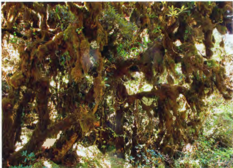
Fig. 1. View of Rhododendron covered by dense bryophytes in Sphagnum bog in Doi Inthanon National Park, Chiang Mai Province, Thailand. Drepanolejeunea laciniata grows on the living leaves and young branches of Rhododendron . Photograph Rui-Liang Zhu, 20 Dec. 2011.

innovations, and segmented oil bodies of leaf cells, which are essential features of Drepanolejeunea . The Thai plant stands out by the relatively large size (main shoots over 1.2 mm wide), non falcate leaves usually with a subacute apex, rectangular leaf lobules 1/2-2/3 as long as the leaf lobes, large leaf cells with thin walls and small trigones, obovate perianth with dense laciniae at apex, free lateral lobular margin proximal to the notch bordered by 9-13 rectangular cells, and bilobed underleaves whose lobes are tongue-shaped and erect. It is here described as a species new to science.