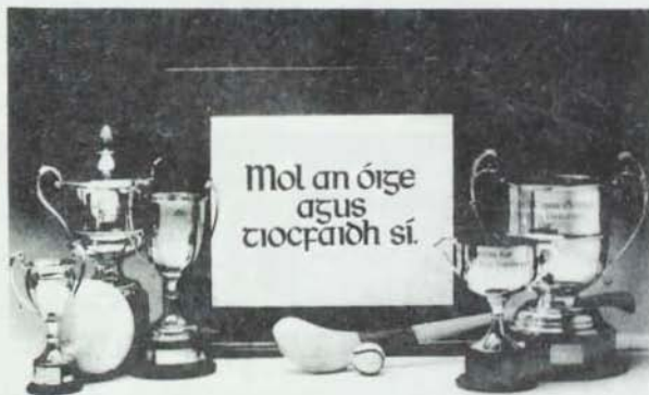
Photo youth and it will benefit you.