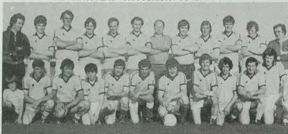
Moyle Rovers, South Junior Football Champions