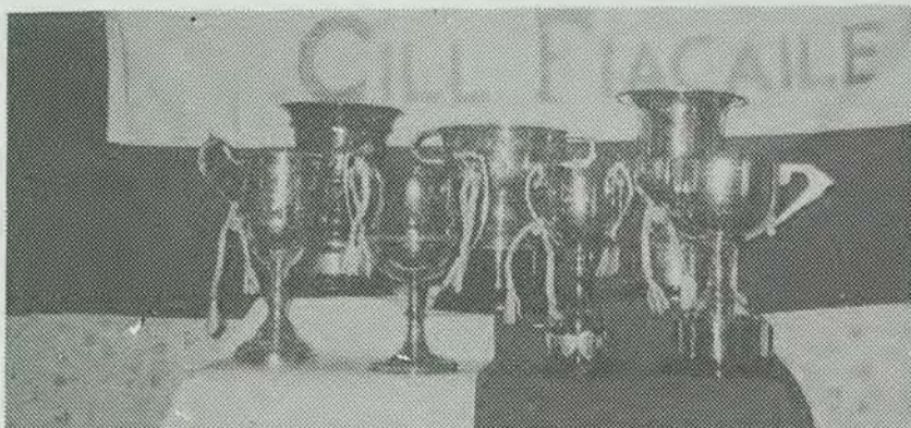
GOLDEN-KILFEACLE: SILVERWARE WON IN 1995