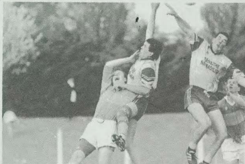
ACTION FROM THE DRAWN GAME