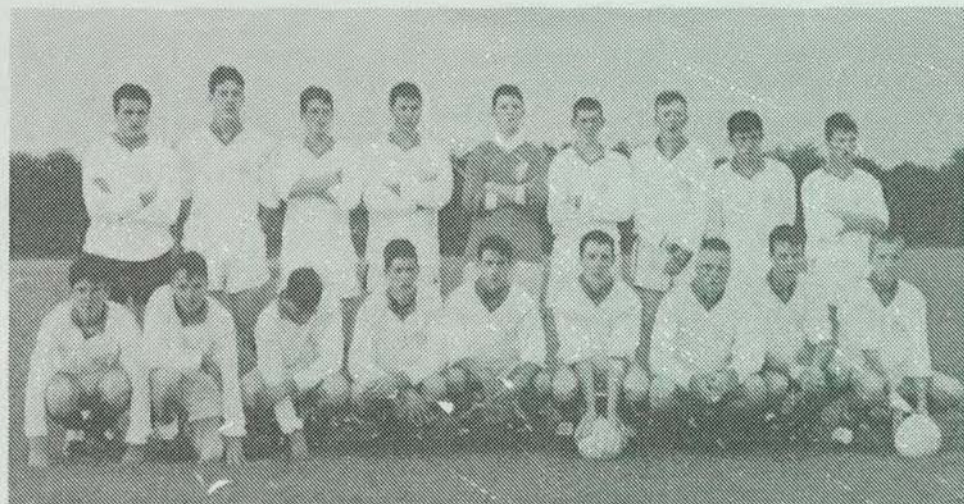
The Golden / Kilfeacle Minor Team