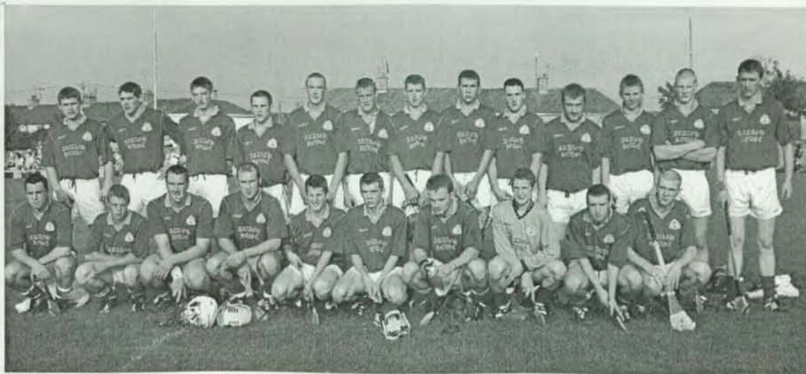
Killenaule South U21 Hurling Champions 2002