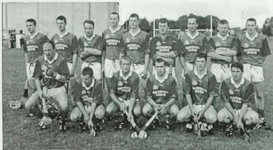
Mullinahone South Champions '99