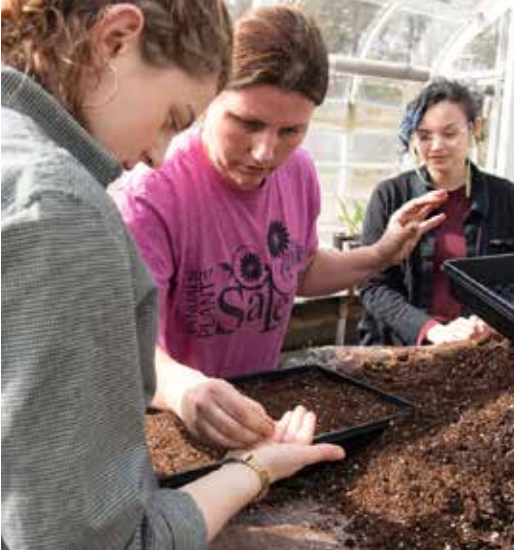
Students planting in the Greenhouse.

The grounds at Montgomery Place continue to be cared for in the same stellar manner as the main campus. In addition to physical maintenance, staff have undertaken a significant amount of research on the history of the gardens, landscape design, and related book collections that has resulted in class projects and public exhibitions, all of which help expand knowledge of the historical importance of the property.