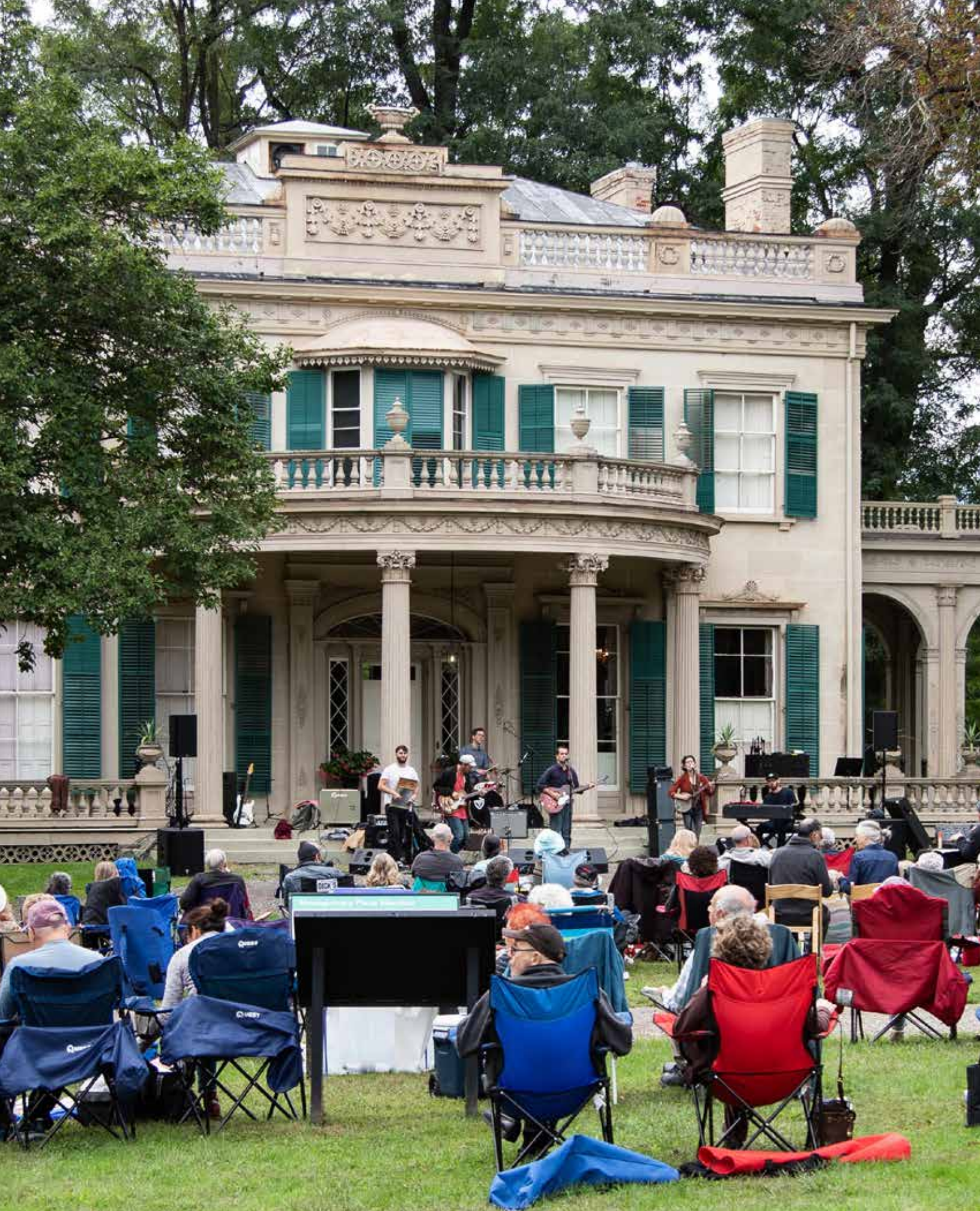
Cover: Montgomery Place, northwest summer view.