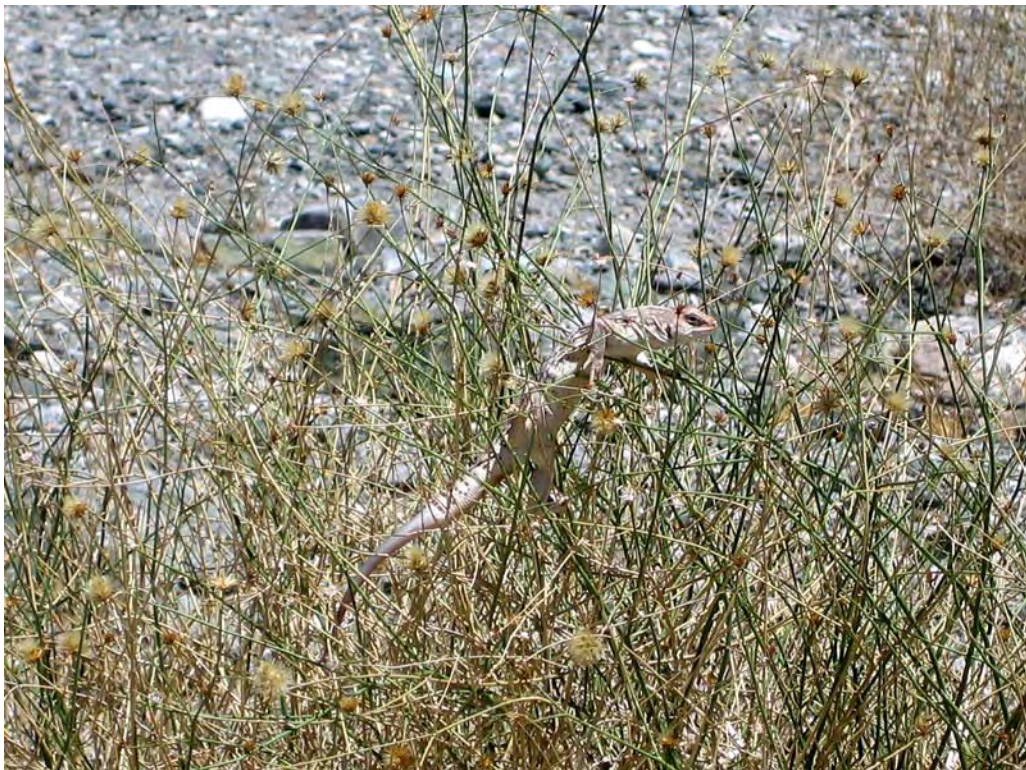
Photo 10. A desert iguana that was incidentally observed during the desert tortoise survey.