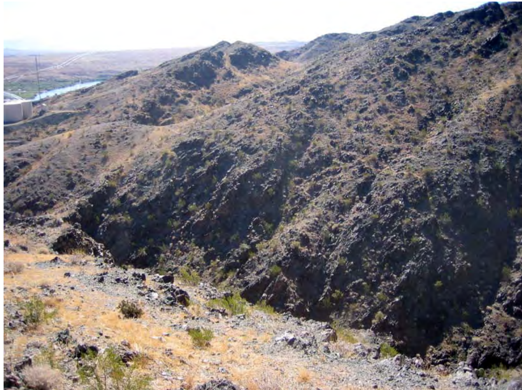
Photo 6. The steep slopes of the Chemehuevi Mountains and drainages.