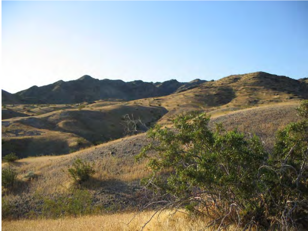
Photo 5. Gently rolling hills west of the compressor station. Note the Chemehuevi Mountains in the background.