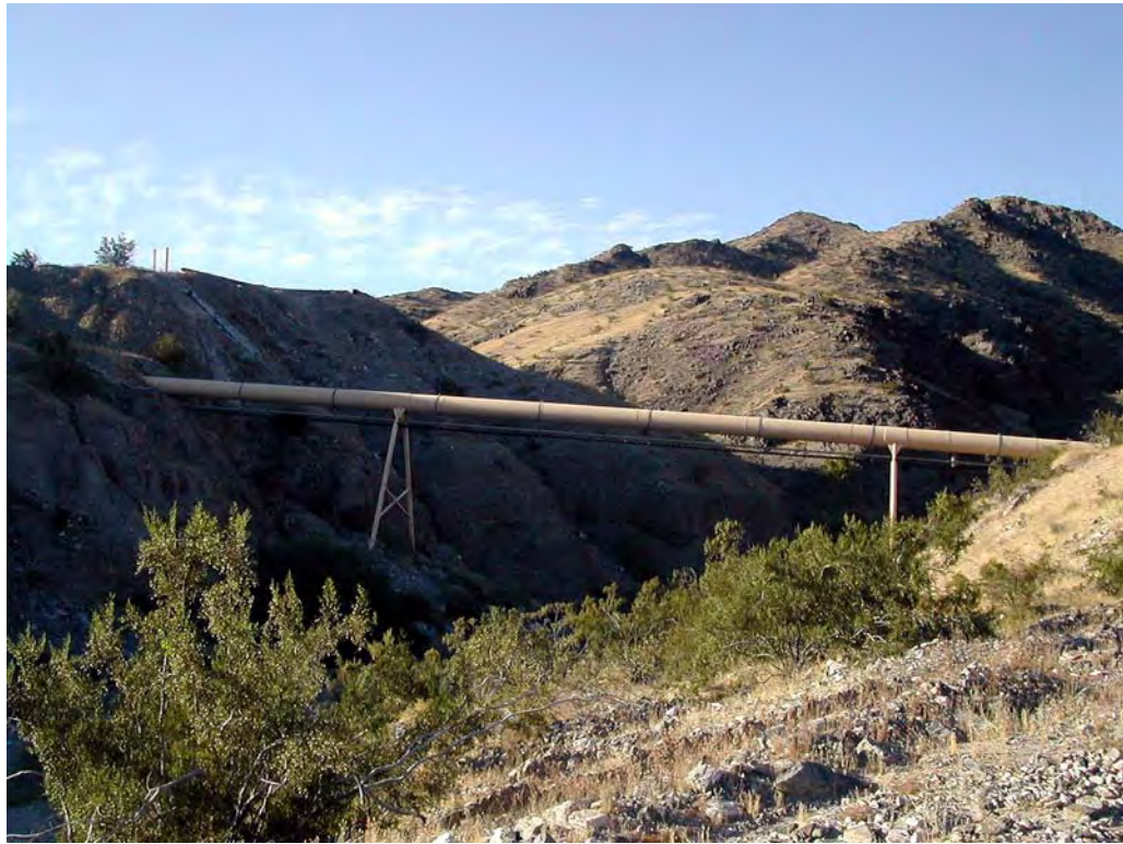
Photo 7. An above-ground portion of the natural gas pipeline over Bat Cave Wash.