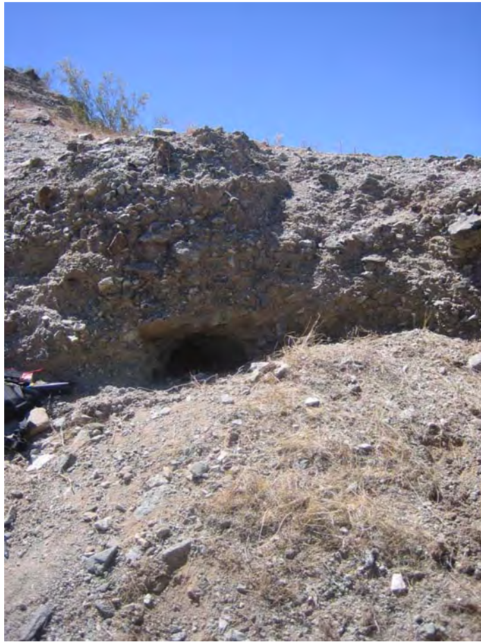
Photo 3. Possible (although unlikely) desert tortoise burrow (B-1).