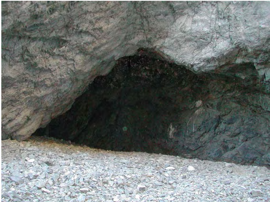
Photo 12. Bat sign observed in Bat Cave Wash.