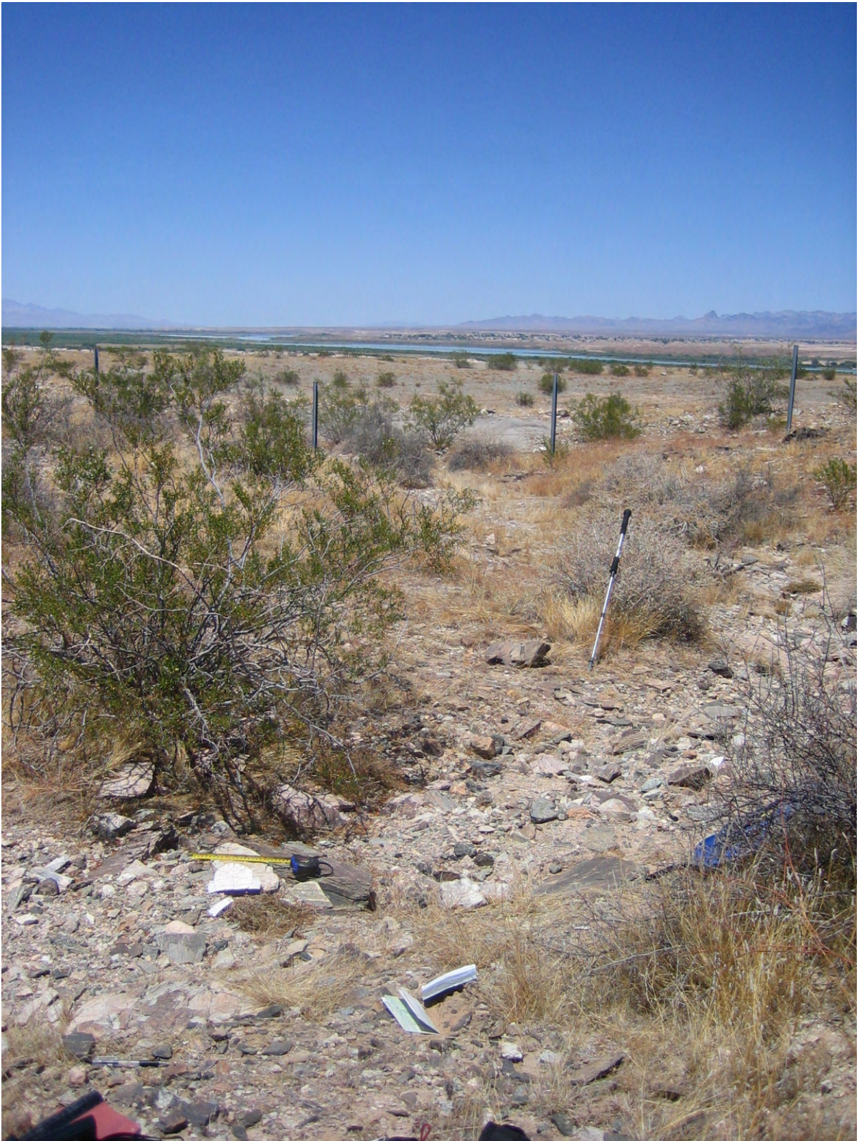
Photo 2. The wash containing the desert tortoise carcass remains.