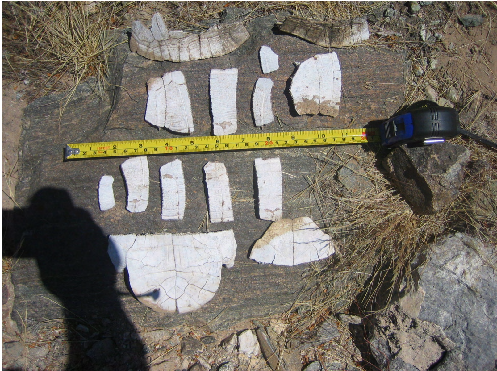
Photo 1. Desert tortoise carcass remains found in the Topock Maze.