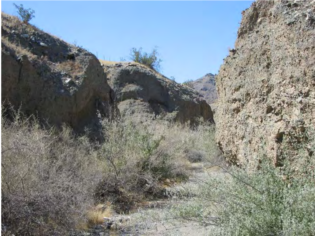
Photo 9. One of numerous dry washes in the southeastern portion of the survey area.