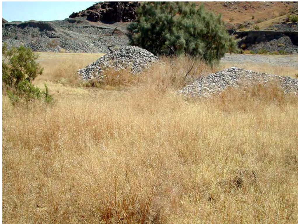
Photo 8. Plantago ovata , interspersed with Eriogonum trichopes and Schismus arabicus covered the ground in the majority of the creosote bush-dominated areas.