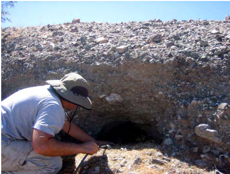
Photo 4. Inspection of a possible desert tortoise burrow (B-2) using a fiber optic scope.