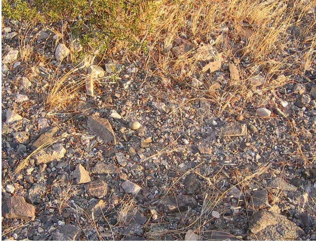
Photo 11. A lesser nighthawk egg was observed near a creosote bush in the eastern portion of the survey area.