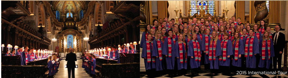
2015 International Tour