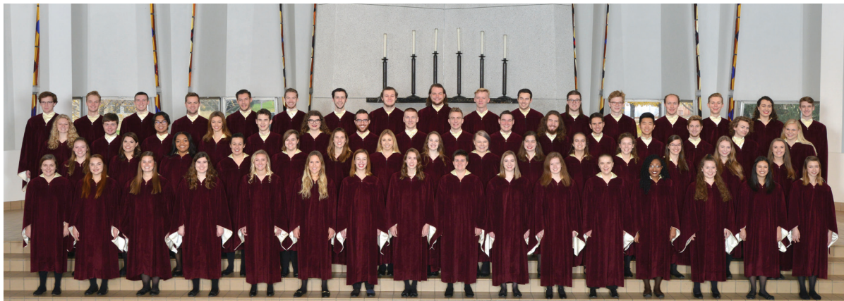
The Gustavus Choir 2019