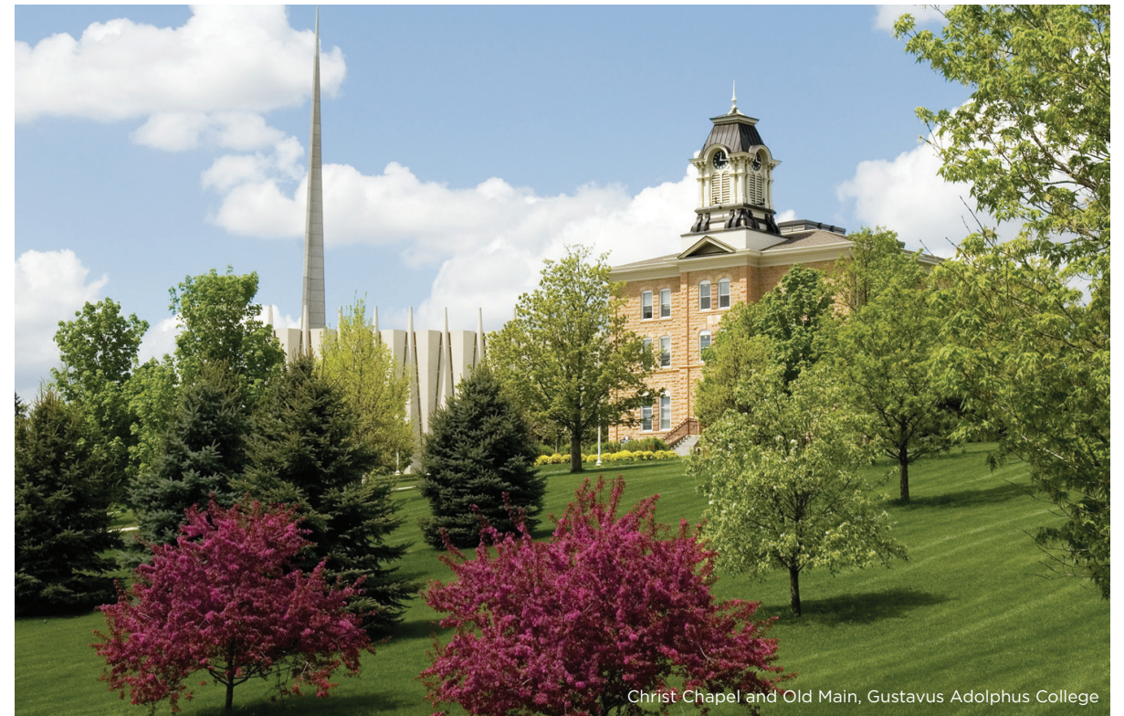
Christ Chapel and Old Main, Gustavus Adolphus College