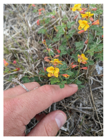
Drummond's Rushpea

The City Nature Challenge is organized by the Natural History Museum of Los Angeles County and the California Academy of Sciences. More information at citynaturechallenge.org