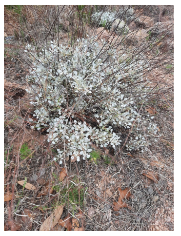
Basin Wild-buckwheat