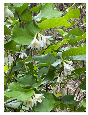
Sycamore-leafed Snowbell