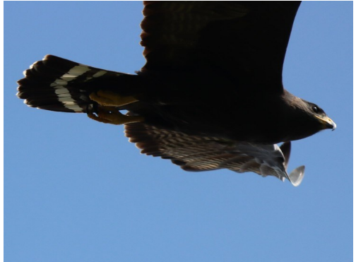
Zone-tailed Hawk

Loggerhead Shrike