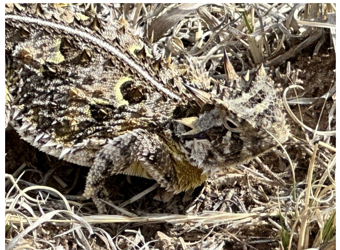
Texas Horned Lizard

Black-tailed Prairie Dog, Cynomys ludovicianus Burrowing Owl, Athene cunicularia Harris' Sparrow, Zonotrichia querula Lark Sparrow, Chondestes grammacus Panhandle or Tall Plains Spurge, Euphorbia strictior Scissor-tailed Flycatcher, Tyrannus forficatus Snowy Egret, Egretta thula Swainson's Hawk, Buteo swainsoni Texas Horned Lizard, Phrynosoma cornutum Wild Turkey, Meleagris gallopavo