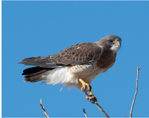
Swainson's Hawk

Data collection Apr 28-May 1 Identifications May 2-7