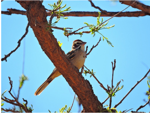
Lark Sparrow

The City Nature Challenge is a global, city-scale urban biodiversity BioBlitz framed as a friendly competition between participating areas.