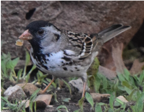
Harris's Sparrow

The City Nature Challenge is a global, city-scale BioBlitz event that frames an urban biodiversity survey as a friendly competition between cities.