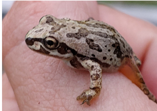
Strecker's chorus frog

Data collection April 26-29 Identifications Apr 30-May 6