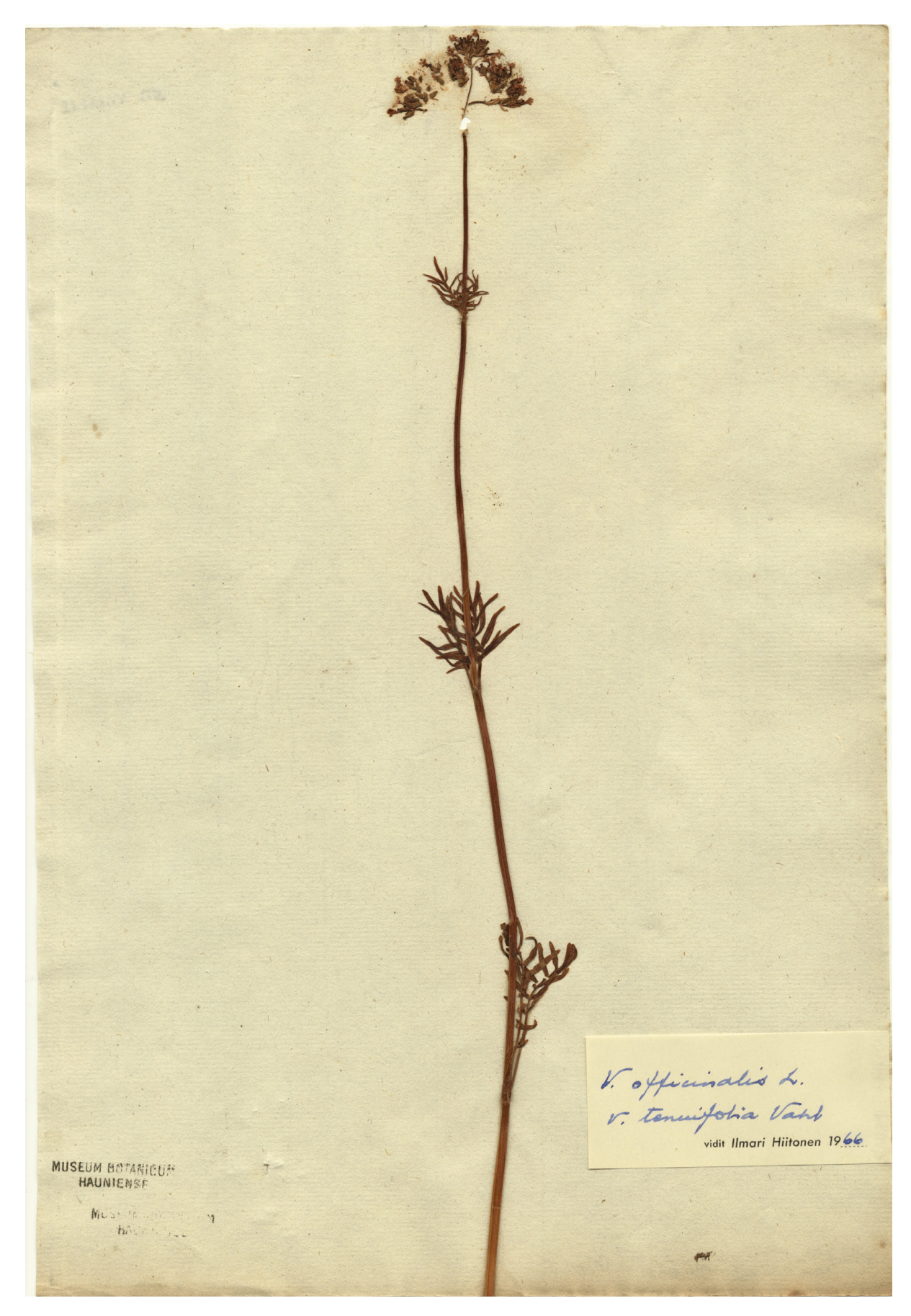
Fig. 4. Lectotype of Valeriana officinalis var. tenuifolia (C).