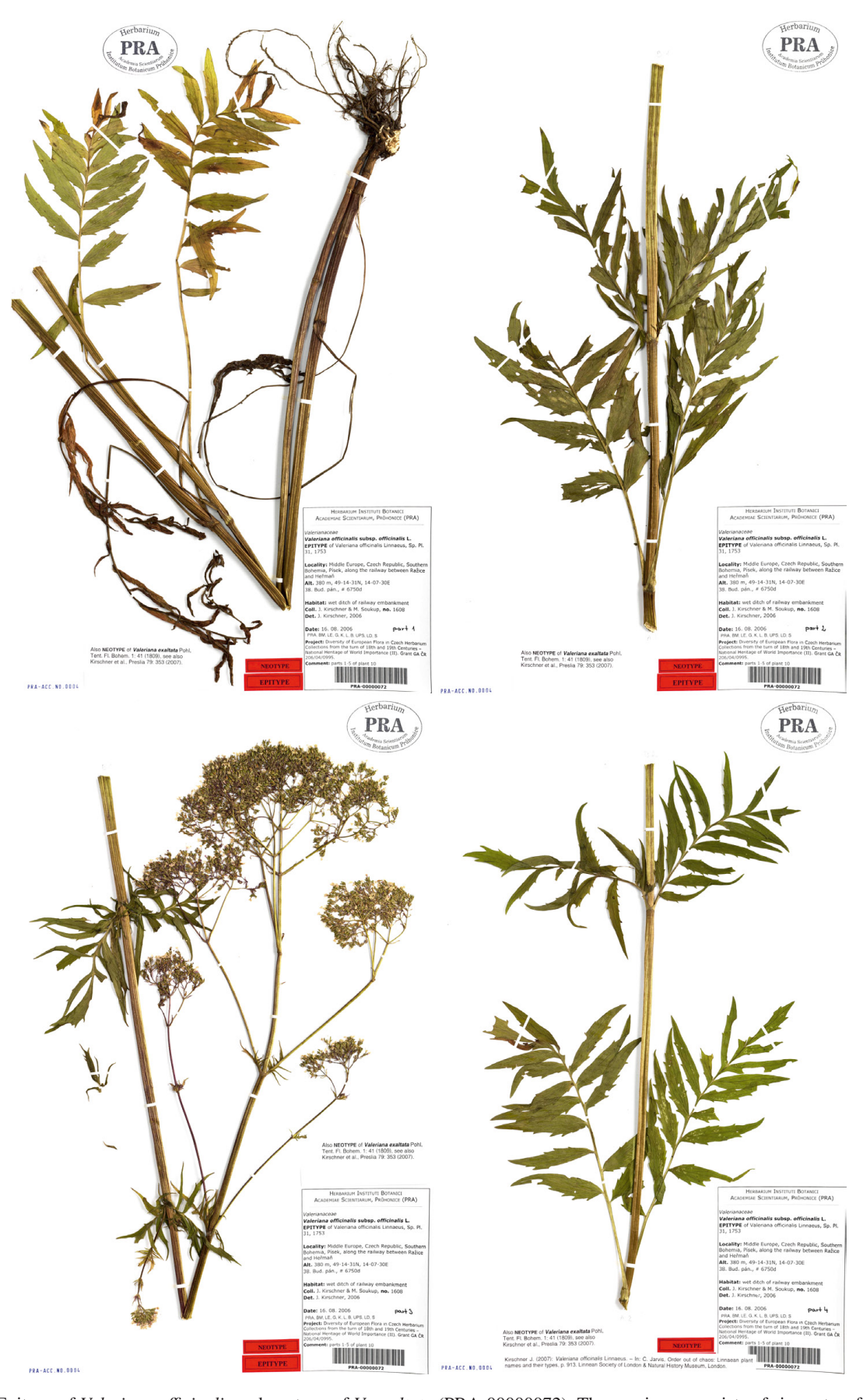
Fig. 2. Epitype of Valeriana officinalis and neotype of V. exaltata (PRA-00000072). The specimen consists of six parts, of which four are shown here.