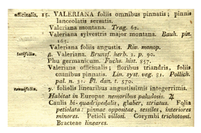
Fig. 3. Protologue of Valeriana officinalis var. tenuifolia (Vahl 1805: 6).