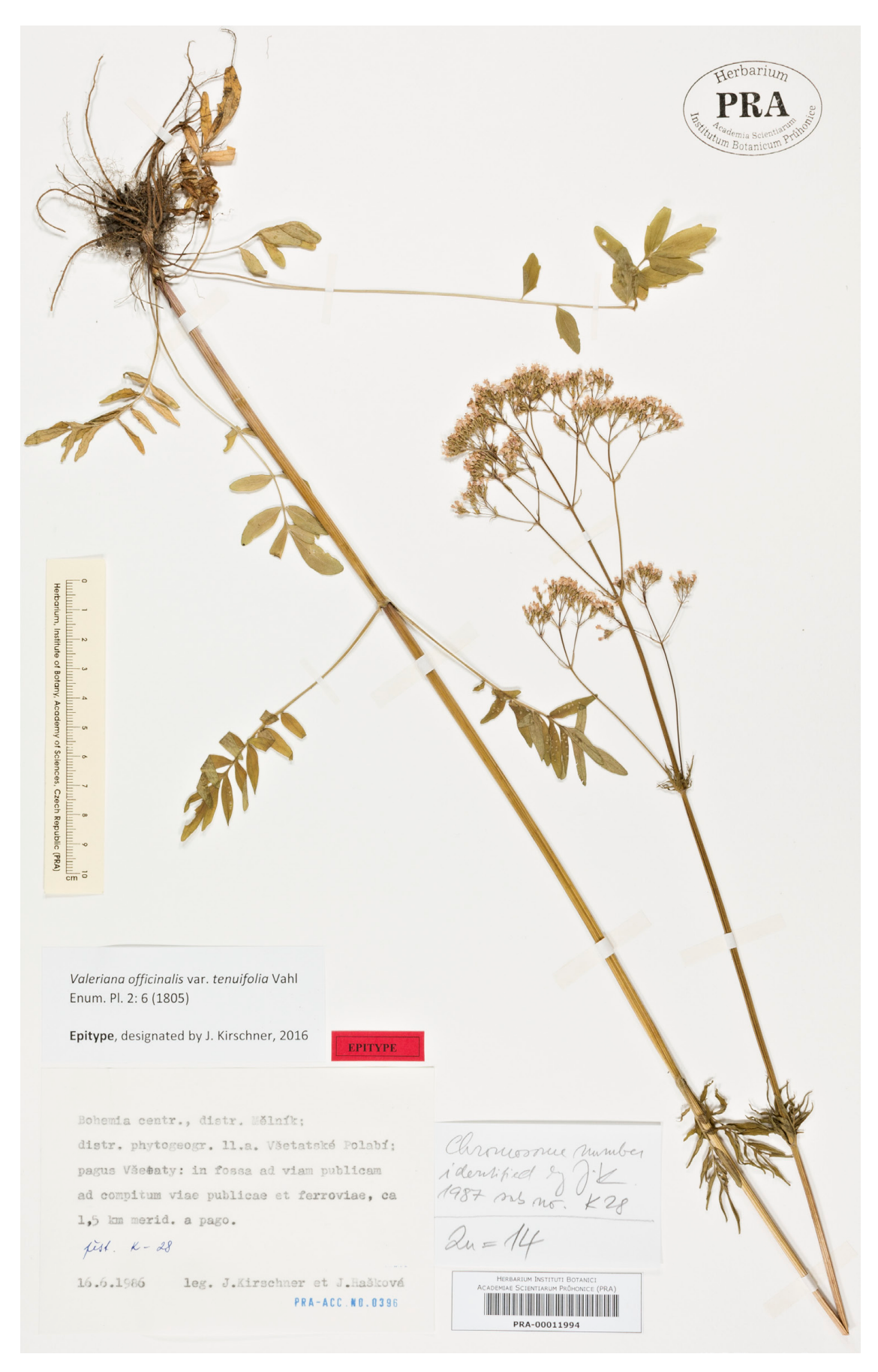
Fig. 5. Epitype of Valeriana officinalis var. tenuifolia (PRA-00011994).