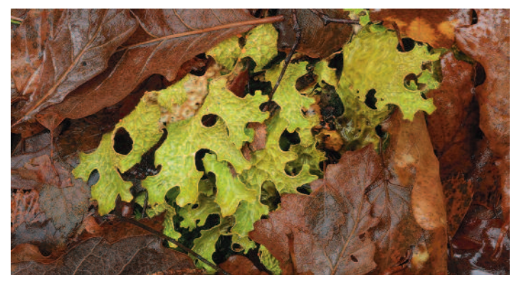
Fallen lungwort amongst leaves near Badger Falls in Glen Affric. When the lichen decomposes, the nitrogen it absorbed from the air will become available as a nutrient for other plants.

Because of the ability of its cyanobacterial symbiont to fix atmospheric nitrogen, tree lungwort makes a significant contribution of nitrogen to the forest ecosystem, when fallen thalli decompose in the litter layer. A closely-related species, Lobaria oregana , has been recorded as occurring at densities of over 1 tonne per hectare in the Pacific Northwest forests of North America, and as adding over 15 kg. of nitrogen per hectare to the soil each year. The decline of tree lungwort in European forests therefore represents a significant loss of a natural source of nutrients.