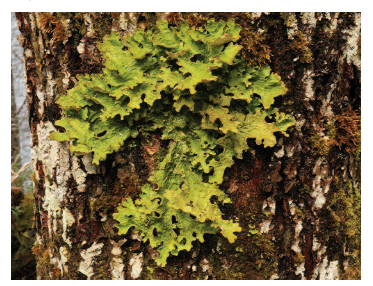
Tree lungwort on the trunk of a goat willow (Salix capraea) in Glen Affric.

Tree lungwort is a widely-distributed species, occurring in much of the northern part of the northern hemisphere. Its range encompasses central, northern and western Europe (including the UK and Ireland), Russia, China, Tibet, India and Iran, and it also occurs in the epiphyte-rich laurel forests of Madeira and the Canary Islands, off the northwest coast of Africa. In North America it is distributed along the west coast from Alaska to central California, and in the east from Newfoundland south through the Appalachian Mountains and in the Great Lakes region. Tree lungwort has also been recorded in the cloud forests of Costa Rica.