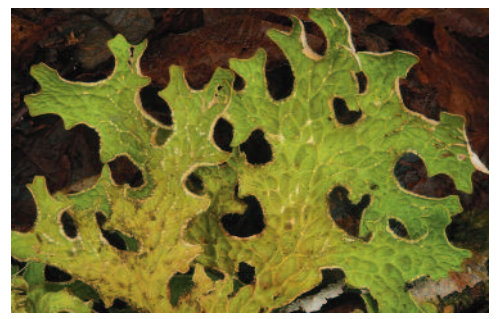
Detail of the lobed thallus of tree lungwort, showing the convoluted surface of ridges and hollows.

The lobes of tree lungwort are from 8 – 30 mm wide, up to 180 mm long and may branch two or three times, giving the thallus a complex and characteristically fractal shape. Lichens