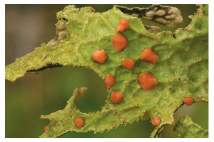
Detail of the thallus of tree lungwort, showing the apothecia. These brown discs are the reproductive structures that release the fungal spores.

Tree lungwort is one of the lichens that consists of a three-way, or tripartite, partnership – in addition to the fungus and alga, it also contains a cyanobacterium ( Nostoc sp. ). Cyanobacteria were formerly known as blue-green algae, but have recently been shown to be types of bacteria, unrelated to algae. The cyanobacterial partner, or symbiont, in tree lungwort gains energy from the sun through photosynthesis, and is also able to absorb nitrogen from the atmosphere and 'fix' it into the thallus of the lichen. The cyanobacteria occur inside small structures called cephalodia that are distributed within the thallus. The algal partner in tree lungwort exists underneath the cortex or upper layer of the lichen, and above the medulla, which is a loosely arranged layer of fungal hyphae. It is the algal partner that gives tree lungwort its bright green colour when wet, as it requires moisture for photosynthesis to take place.