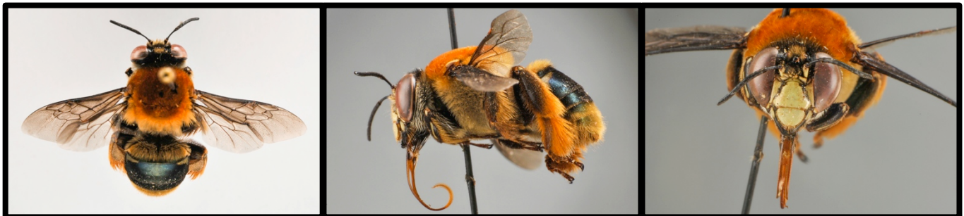
Fig. 2. Dorsal, lateral, and anterior views of C. decolorata collected at Castle Bruce Beach and Estuary on 5-VI-2015 via sweep net.

Centris decolorata was identified from three specimens collected at Castle Bruce Beach and Estuary using sweep nets on 5-VI-2015 (Fig. 2).