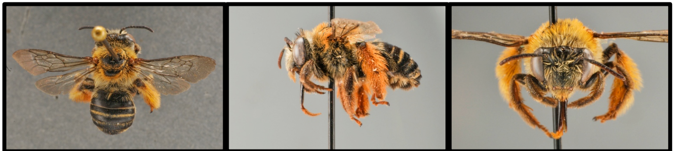
Fig. 5. Dorsal, lateral, and anterior views of a female Melissodes sp. 1 collected at Castle Bruce Beach and Estuary on 5-VI-2015 via sweep net.

One male and two female bees in the genus Melissodes were collected at Castle Bruce Beach and Estuary using sweep nets on 5-VI-2015 (Fig. 5, Fig. 6).