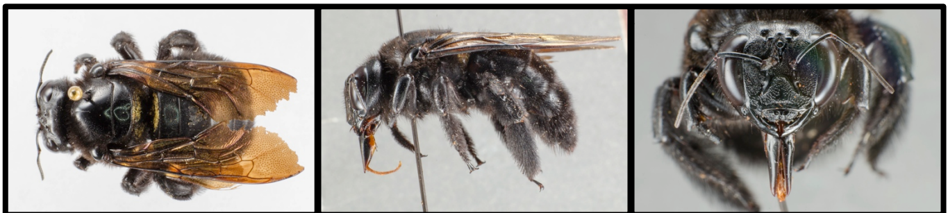
Fig. 8. Dorsal, lateral, and anterior views of Xylocopa sp. 1 collected in Kalinago Territory on 5-VI-2015 via sweep net.

The genus Xylocopa was represented by a single bee collected in Kalinago Territory on 5-VI-2015 using a sweep net (Fig. 8).