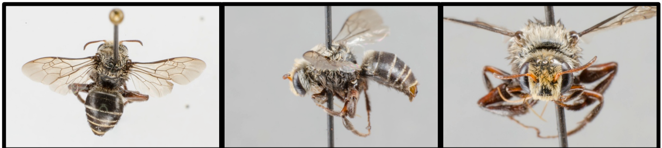
Fig. 9. Dorsal, lateral, and anterior views of Apidae 1 collected at ATREC on 31-V-2015 via pan traps.

Two individuals of Apidae 1 were collected at ATREC on 31-V-2015 in pan traps (Fig. 9).