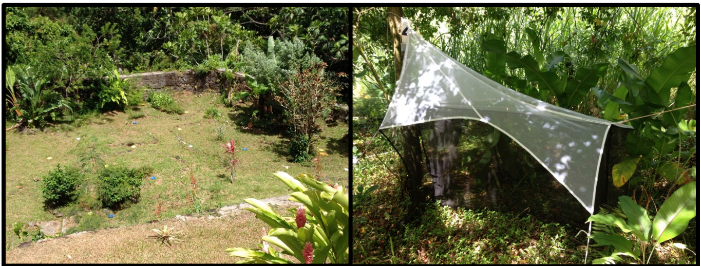
Fig. 1. Yellow, blue, and white pan traps and a Malaise trap at ATREC on 13-VI-2015.

Malaise traps were placed at ATREC and the Checkhall River from 30-V-2015 to 13-VI-2015, on Mount Joy from 30-V-2015 to 11-VI-2015, at two sites in Cabrits National Park from 2-VI-2015 to 8-VI-2015, and at two sites along the trail to Middleham Falls from 31-V-2015 to 7-VI-2015 (Table 1, Fig. 1). Sweeping and other insect net techniques were used periodically at ATREC, Kalinago Territory, the Dominica Botanical Gardens, Castle Bruce Beach and Estuary, and Roseau between the dates of 29-V-2015 and 16-VI-2015 (Table 1). Kill jars charged with ethyl acetate were used to kill the bees after they had been captured in the nets. Some bees were also killed in 95% ethanol. Additionally, a light sheet was set up each evening from approximately 8:00 P.M. to 1:00 A.M. at ATREC between 30-V-2015 and 7-VI-2015.