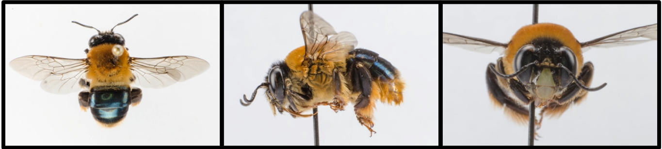
Fig. 4. Dorsal, lateral, and anterior views of C. versicolor collected at ATREC on 3-VI-2015 via pan traps.

Centris versicolor (F.) was represented by two specimens collected at ATREC in blue pan traps on 1-VI-2015 and 13-VI-2015, one collected in a pan trap on 3-VI-2015, one collected via sweep net on 13-VI-2015, and one collected in the Malaise trap between 1-VI-2015 and 13-VI-2015 (Fig. 4).