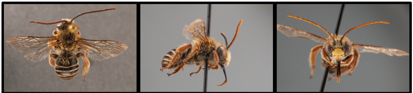
Fig. 6. Dorsal, lateral, and anterior views of a male Melissodes sp. 1 collected at Castle Bruce Beach and Estuary on 5-VI-2015 via sweep net.