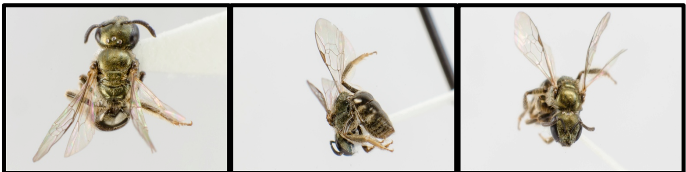
Fig. 10. Dorsal, lateral, and anterior views of Lasioglossum n.sp. collected at ATREC on 31-V-2015 via pan traps.