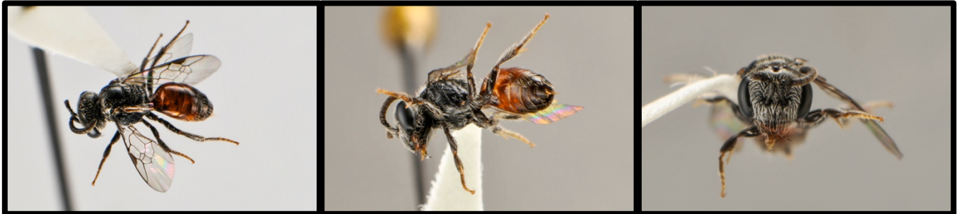
Fig. 11. Dorsal, lateral, and anterior views of a female Sphecodes n.sp. collected at ATREC on 6-VI-2015 via pan traps.

Five specimens representing a new Sphecodes species were collected over the course of the survey (Fig. 11). All of the individuals were captured in pan traps at ATREC, one each on 3 and 6-VI-2015 as well as two between the dates of 7-VI-2015 and 8-VI-2015.