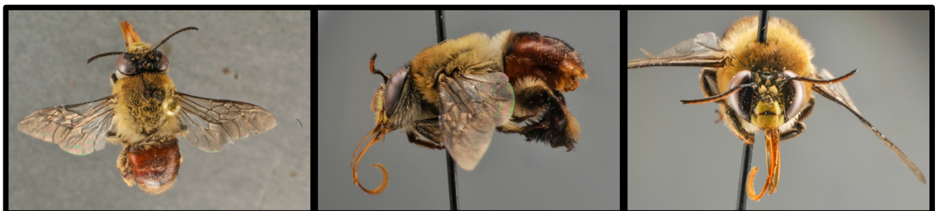
Fig. 3. Dorsal, lateral, and anterior views of C. lanipes collected at Dominica Botanical Gardens on 10-VI-2015 via sweep net.

Two C. lanipes individuals were collected at the Dominica Botanical Gardens using sweep nets on 10-VI-2015 (Fig. 3).