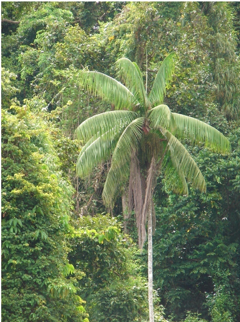
Fig. 1. R. augusta in Great Nicobar Islands.

from sea level to 900 m in lowland rain forest and in lower montane forest. Rhopaloblaste has a remarkably disjunct distribution (Baker et al. 1998) and among the six species, only one species R. augusta occurs in India and is endemic to Nicobar Islands. These Islands are rich in natural forest vegetation, lie in the eastern Bay of Bengal, and are the peaks of a submerged mountain range