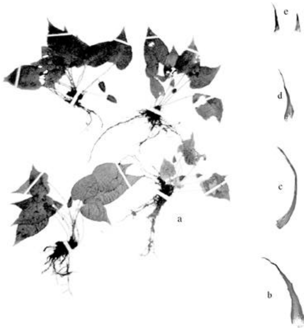
Fig. 10. Elaphoglossum solomonii (J. Solomon 18827, UC): a) Type specimen. b) Rhizome scale. c) Stipe scale. d) Costal scale. e) Blade margin scales. (scales b-e: 25x).

This species differs from E. cordifolium by shorter (2-3 mm long vs. 4-7 mm) rhizome scales, shorter [(3.5-) 6.0-15.0 cm long vs. 12-25 cm) fronds, dispersed (vs. dense) stipe scales, ovate (vs. lanceolate) blade, and fertile fronds shorter than the sterile (vs. longer than the sterile).