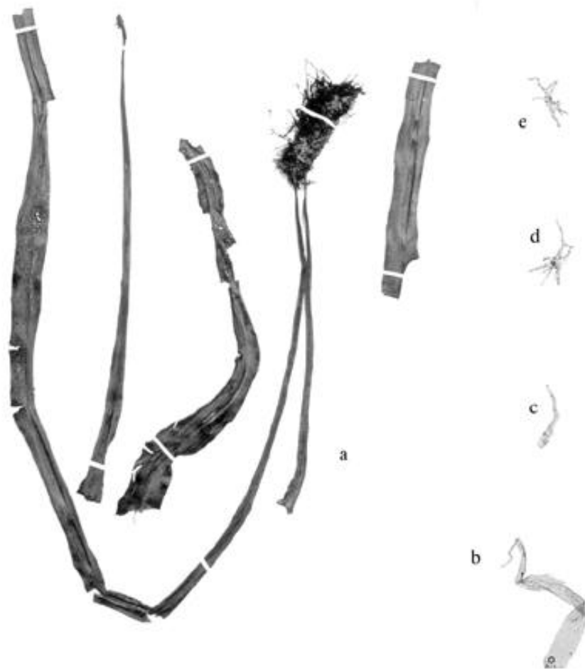
Fig. 9. Elaphoglossum pseudoherminieri (R. Moran 5083, F): a) Type specimen. b) Rhizome scale. c) Stipe scale. d) Costal scale. e) Blade scale. (scales b-e: 25x).

Epipetric; rhizome 5-7 mm diam., compact, ascending; rhizome scales 1-3 x ca. 1 mm, ovate, yellowish to brown, marginally entire; phyllopodia absent; fronds (16-) 25-33 cm long; stipes 2/9-2/5 the frond length; stipe scales 1-2 x ca. 0.5-1.0 mm, ovate, brown, opaque, dispersed, marginally entire; blades 12-21 x 4-7 cm, lanceolate, chartaceous to spongiosus, basically truncate equilateral to inequilateral, apically acute to acuminate; costal scales 1-2 x 0.5-1 mm, ovate, brown, dispersed, marginally entire to erose; blade scales 0.5-1 x 0.2-0.4 mm, ovate, light brown, dispersed, basically erose to ciliate; veins few evident, simple to 1-forked, 1-2 mm apart, diverging at 60-70° from costa;