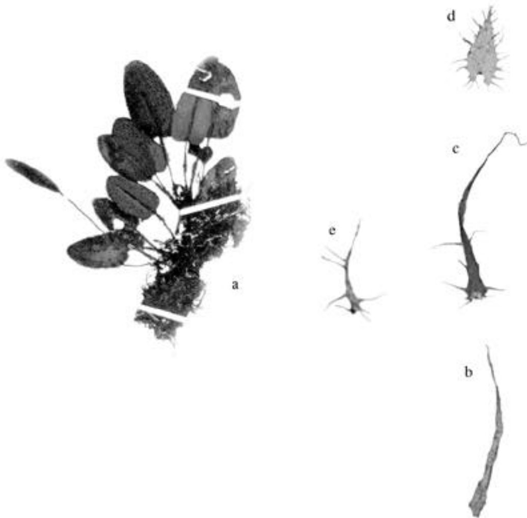
Fig. 2. Elaphoglossum betancuri (J. Betancur et al. 650, UC): a) Type specimen. b) Rhizome scale. c) Stipe scale. d) Costal scale. e) Blade scale. (scales b-e: 25x).

marginally ciliate, deciduous adaxially, more dense in the margin; blade surface darker adaxially; veins evident, free, 1-2-forked, ca. 1 mm apart; hydathodes absent; fertile fronds 9 cm; stipe ca. 3/5 of the frond length; fertile blade 4 x 0.9 cm, elliptic, basically cuneate, apically obtuse; costal scales 1-2 mm diam., ovate to skeletonized, marginally long ciliate; intersporangial scales absent.