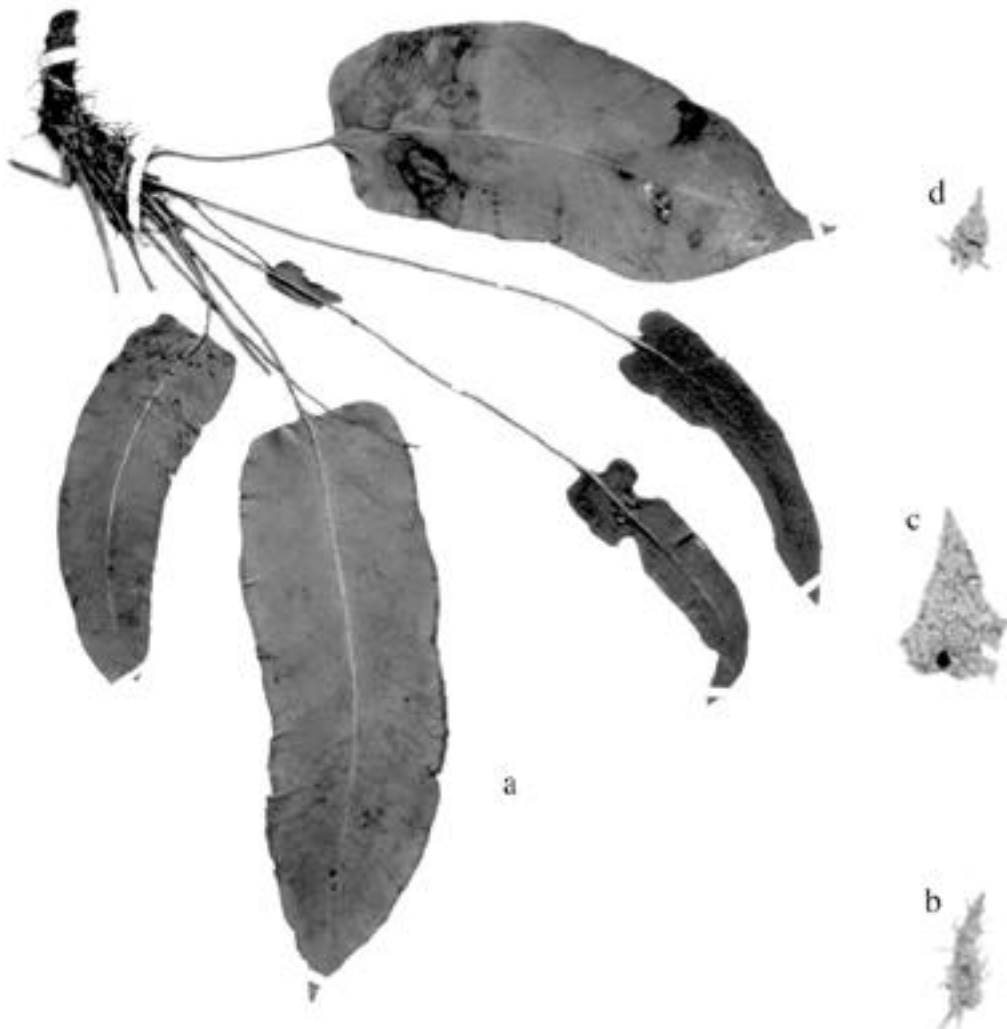
Fig. 8. Elaphoglossum paxense (J. Solomon 14954, F): a) Type specimen. b) Stipe scale. c) Costal scale. d) Blade scale. (scales b-d: 25x).

in branched (vs. not branched) rhizome, fronds 1.5-3.0 cm distant (vs. 0.5-1.5 cm), ovate (vs. elliptic) blade, with broadly cuneate (vs. attenuate) base and obtuse to rounded (vs. acuminate) apex. Also is similar to E. affine (M. Marten et Galeotti) T. Moore in its creeping rhizome and blade size, but differs in longer (2-5 vs. 2-3 mm) and linear-lanceolate (vs. ovate) rhizome scales with blackish apex (vs. blackish center); ovate to rhomboid (vs. elliptic), basically broadly cuneate (vs. cuneate) and apically obtuse to rounded (acute to obtuse) blades; and bigger