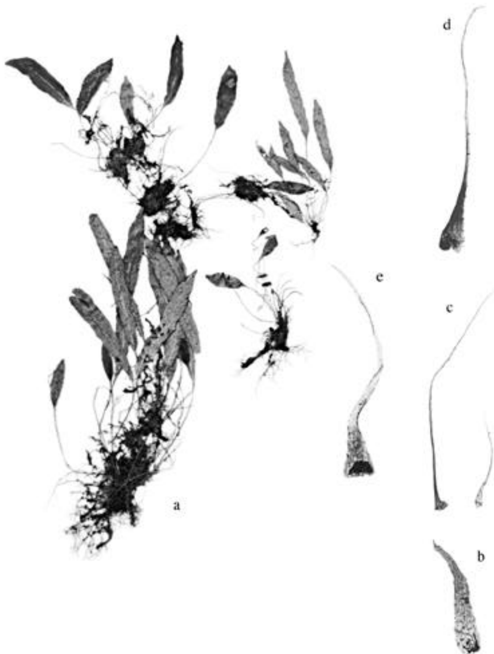
Fig. 1. Elaphoglossum adrianae (A. Rojas and R. Delgado 3793, INB): a) Type specimen. b) Rhizome scale. c) Stipe scales. d) Costal scale. e) Blade scale. (scales b-e: 25x).

Paratypes: COSTARICA. Alajuela: near La Laguna, 6 to 8 km S of Villa Quesada, 1 200 m, A. Molina et al. 17515 (CR). Cartago: Reserva Tapantí, 1 300-1 800 m, L.