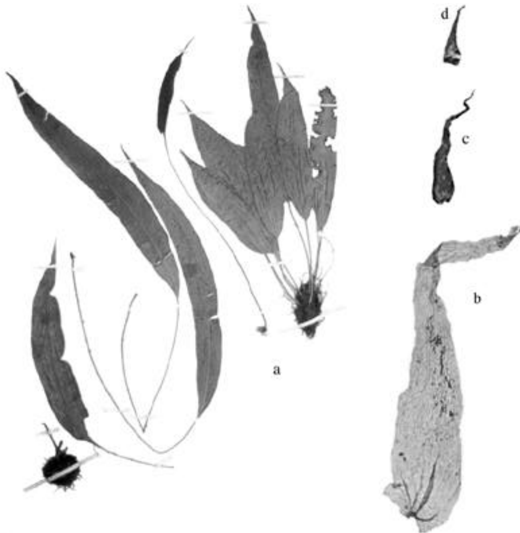
Fig. 5. Elaphoglossum kessleri (M. Kessler et al. 7345, UC): a) Type specimen. b) Rhizome scale. c) Stipe scale. d) Blade margin scale. (scales b-d: 25x).

and glabrous in 1-2 mm (vs. completely covered with sporangia) fertile blade margin.