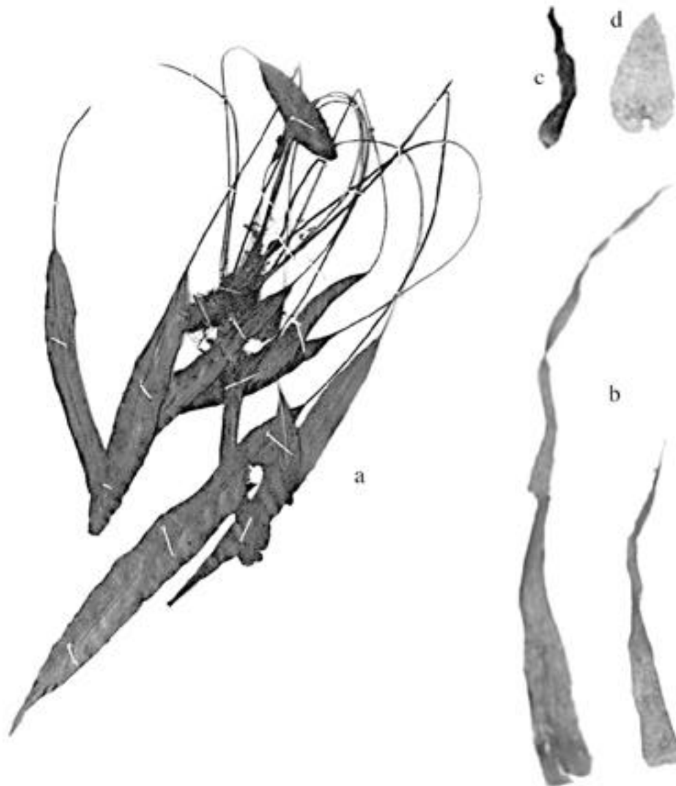
Fig. 6. Elaphoglossum macdougallii (J. MacDougal et al. 4339, MEXU): a) Type specimen. b) Rhizome scales. c) Stipe. d) Costal scale. (scales b-d: 25x).

This species is dedicated to John MacDougal botanist at the Missouri Botanical Garden and collector of the type material.