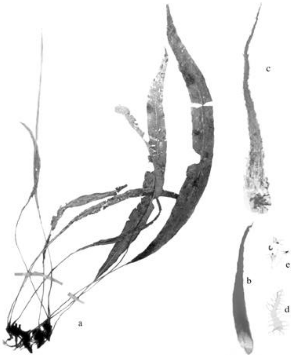
Fig. 3. Elaphoglossum caridadae (A. Rojas and L. Mejía 1374, INB): a) Type specimen. b) Rhizome scale. c) Stipe scale. d) Costal scale. e) Blade scales. (scales b-e: 25x).