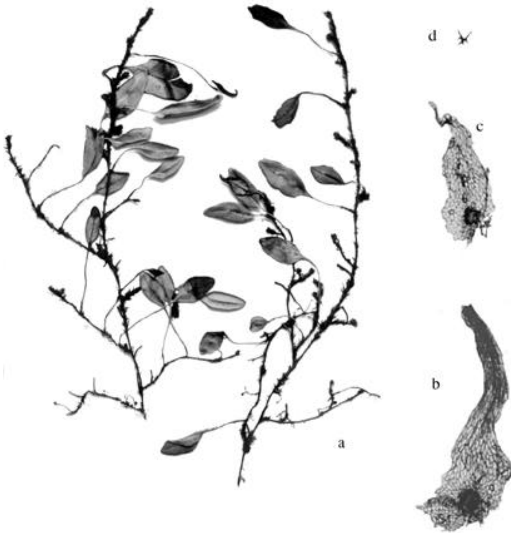
Fig. 7. Elaphoglossum paramicola (J. Archibald 4015, F): a) Type specimen. b) Rhizome scale. c) Stipe scale. d) Blade scale. (scales b-d: 25x).

blackish apex, marginally entire to occasionally dispersed dentate; phyllopodia 8-30 mm long; fronds 4.5-11.0 cm long, 1.5-3.0 cm distant; stipes (1/2-) 2/3-3/4 the frond length; stipe scales 1-3 x ca. 1 mm, same as rhizome scales; blades (1.5-) 2.5-5.5 x (1.0-) 1.5-2.5 (-3.0) cm, coriaceous, ovate to rhomboid, basically broadly cuneate, apically obtuse to rounded,